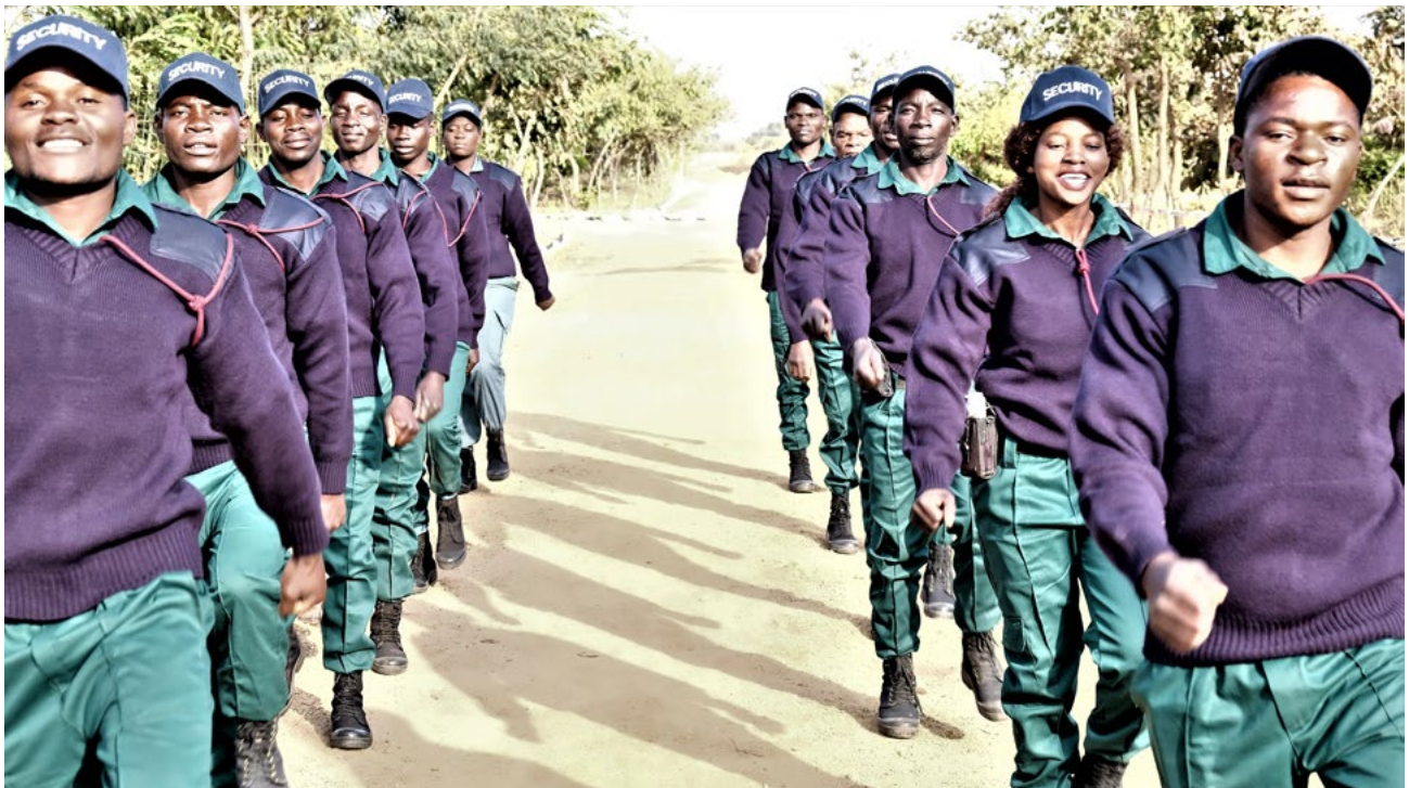
■ Team of Kuwala security guards - doing morning parade to keep themselves physically fit. Kuwala_2023.