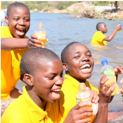
■ Students enjoying their soft-drinks to contribute the pop bottles in an experiment to see if they can make a life jacket and keep afloat. Kuwala_2023.

The Form 1 and 3 students enjoyed a year-end field trip to Kabumba Beach on Lake Malawi. For many of these girls, it was the first time outside their rural area and to a lake. The bus trip was buzzing with many conversations and laughter, and the anticipation of the day's activities was exciting. The trip allowed them to travel through the sights and sounds of the big city of Lilongwe, which so many of the students have never had the opportunity to visit. They were able to appreciate what they had been learning in Geography. They observed mountains, large natural forest areas and swamp lands. Seeing the blue waters of the lake was unique to them as they could only relate to how beautiful it was through books. The teaching staff organized teams of students and teachers for competitive games of a tag of war and beach football, known as soccer in North America. The girls got to wear the new colourful team pinnies that the Canadian Board members brought over in May, and the beach sand was perfect for a football field, running barefoot! One of the students noticed that one of their beverage bottles was floating while enjoying a cold beverage in the lake. Curious, Lodges tried to put four empty bottles inside her T-shirt and tried to swim. Surprisingly, it worked; she could swim! Very