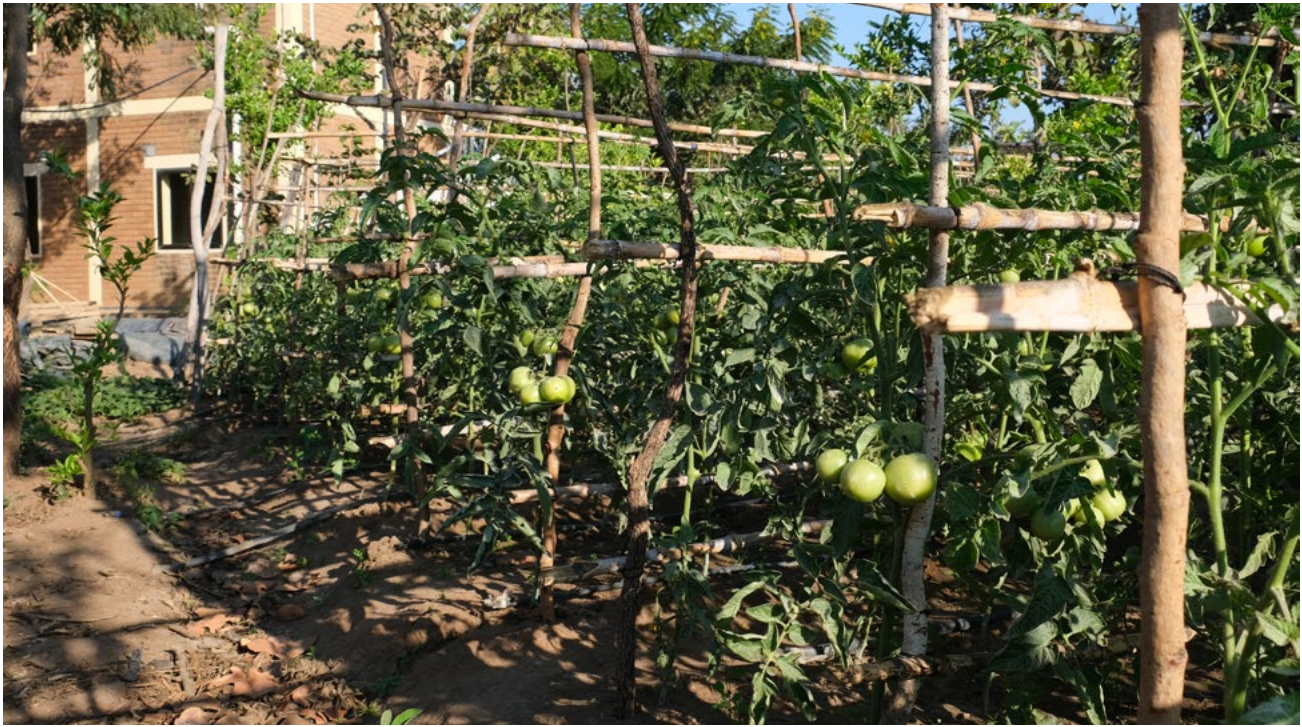
■ Tomatoes have started bearing fruit - expecting to reduce the tomato scarcity during winter season. Kuwala_2023.