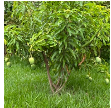
■ Mango tree. Kuwala_2023.

Built with resilience in mind, our school is designed to withstand climate change's harshest impacts, from enduring droughts to destructive floods. But, we're more than just a school. We're a hub for