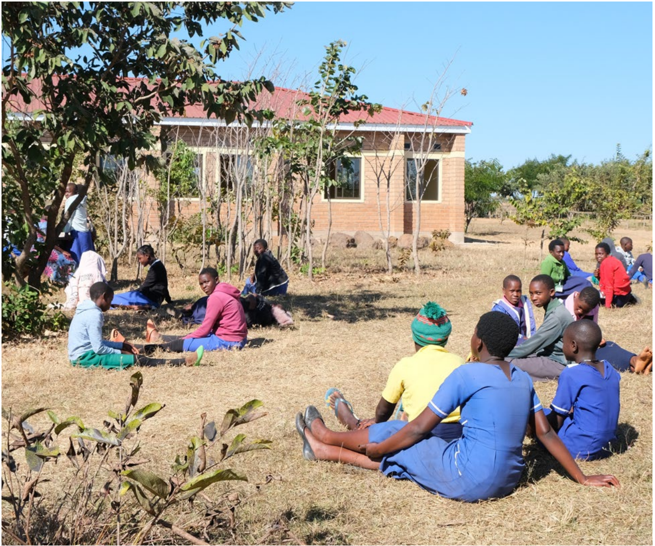
■ Girls from different schools have come to attend oral interviews after passing written entrance examinations for Kuwala scholarships. Kuwala_2023.

Form 2 students have gone home for the holiday break and have been given Form 3 activities for homework. Before the break, Form 2 students are encouraged by the administration to practice small business thinking like teaching the community children on topics such as reading and gardening. Form 3 girls, however, are still in school. The teachers will follow up with each of them to provide additional support to further their studies.