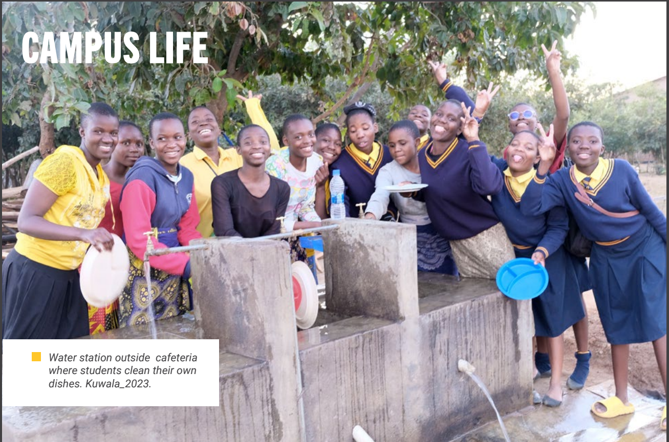
■ Water station outside cafeteria where students clean their own dishes. Kuwala_2023.