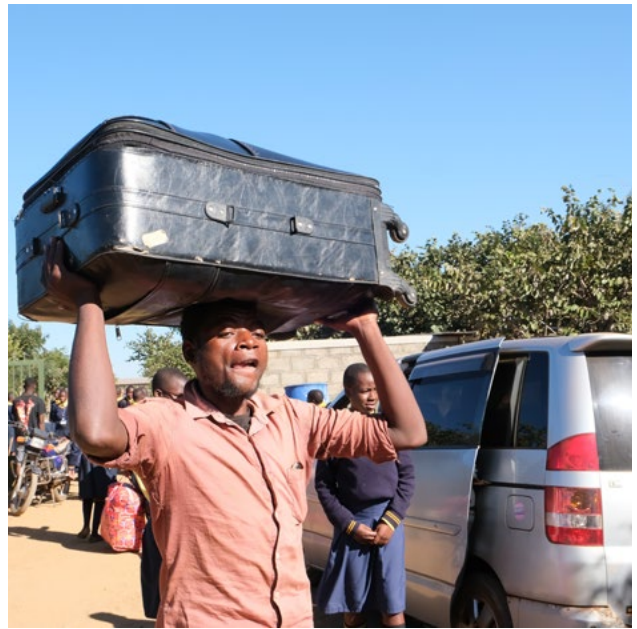
■ Parents are helping their daughters carrying bags; this one looks heavy.

HEADING HOME FOR A BREAK, THE GIRLS PROMISE TO CONTINUE THEIR STUDIES.