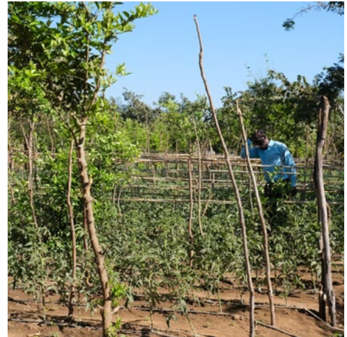
■ Staking tomatoes. Kuwala_2023.

This month Innocent, the farm manager improved the nursery beds and built-in platforms to protect from erosion using different soils mixed with enriching the crops. Farm Manager Innocent has become very creative in farming practices and developing irrigation lines to keep hydrating the crops in the ground. Kuwala has also initiated planting pine trees and walkway hedges to protect the ground crops and add to the beauty of an ever-expanding campus. There is a constant increase in the volume of tomatoes grown in the greenhouse and gardens. Innocent has developed a way to stake them higher for more excellent production. Last month, the cyclone that ripped through Malawi devastated the communities' tomato crops. Fresh tomatoes are a crucial component of the Malawian diet, eaten fresh with almost every meal.