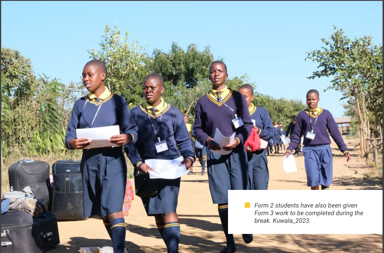
■ Form 2 students have also been given Form 3 work to be completed during the break. Kuwala_2023.