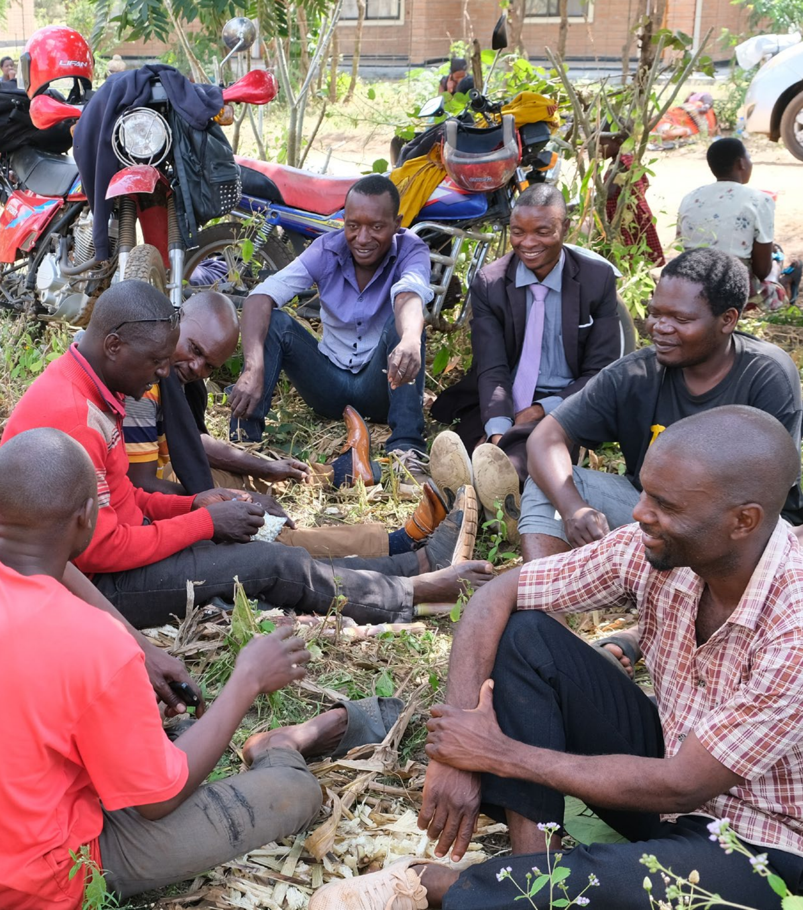
■ The Form 1 entrance exams have become a community event. Here the parents are waiting at Kuwala while their daughters are writing the exam. Kuwala_2023.