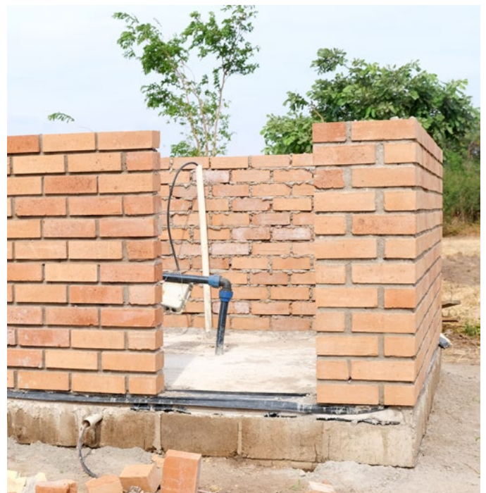
■ Water pump house construction, Kuwala_2022.