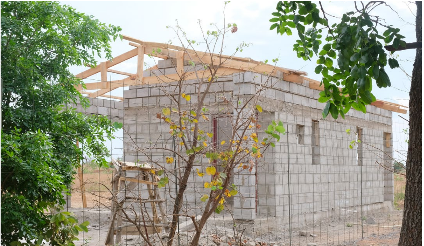
■ Milling house construction for maize grinder, Kuwala_2022.