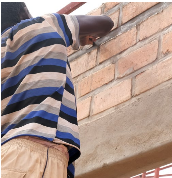
■ Worker applying mortar to second classroom block, Kuwala_2022.