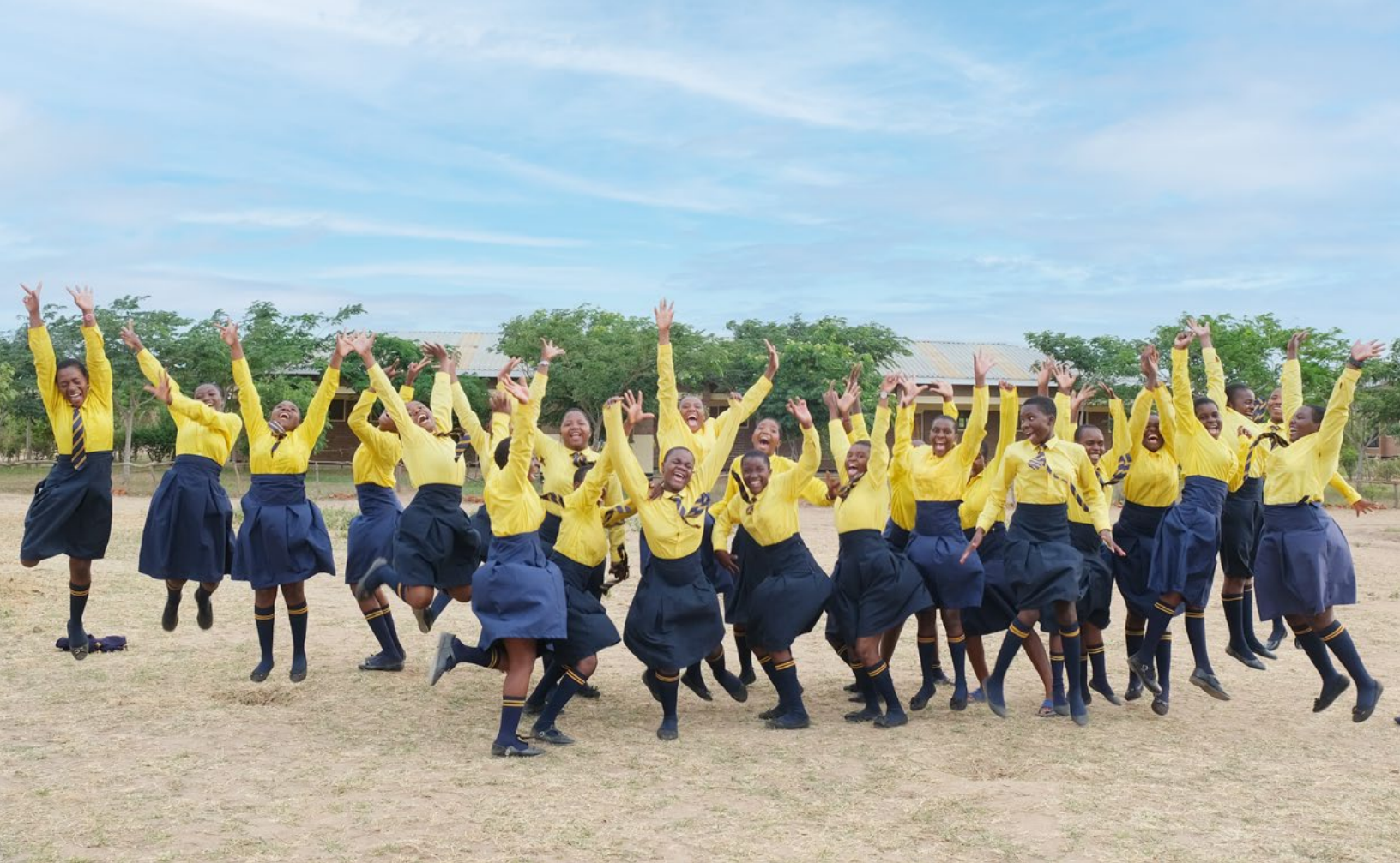
■ Form 4 students are excited for their final year at, Kuwala_2022.