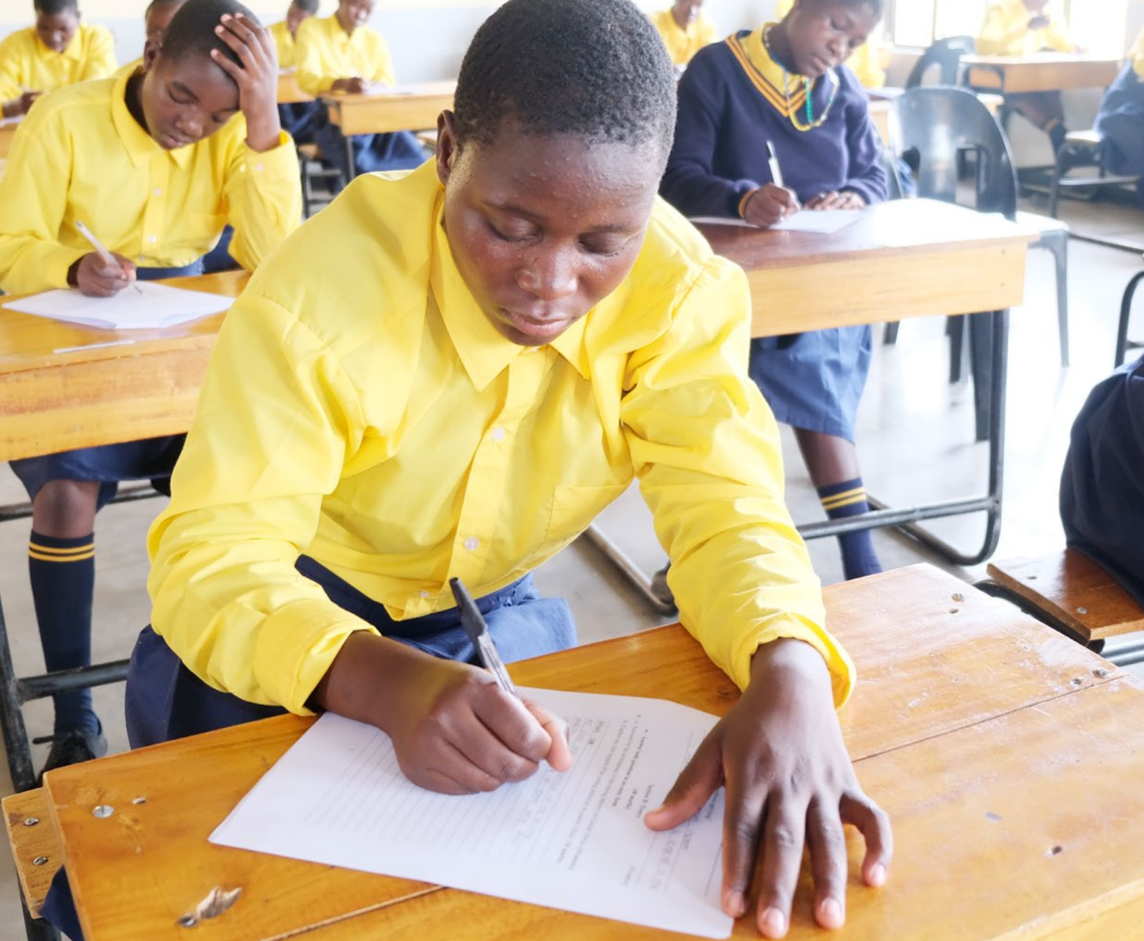
■ Student writing formal mid-term exam, Kuwala_2022.