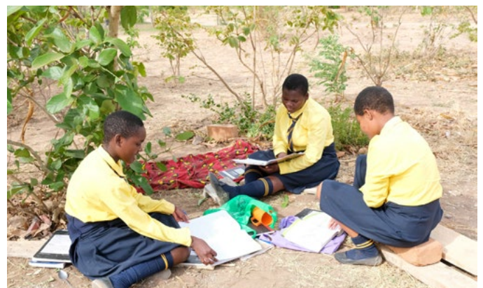
■ Students preparing for mid-terms, Kuwala_2022.

The first term is coming to an end. All the students completed mid-term exams in November. There are three terms in each school year, and at the halfway point of each term, there is a week where lessons are ceased and the teachers and students prep for mid-term exams in each subject. At the end of the exam week, the parents attend an evaluation Saturday. It is a scheduled day to visit, review and cheer on the girls. Representatives from the Kuwala Parent Teachers Association had the privilege of meeting with all the parents to introduce their role at the school. A good turnout from parents greatly encouraged the students and teachers.