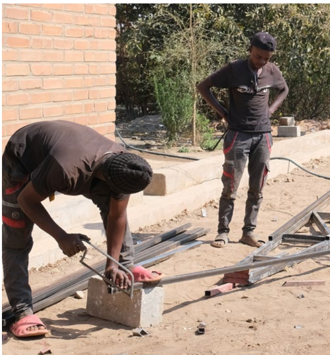
■ Metal workers cutting and welding for the roof trusses, Kuwala_2022.