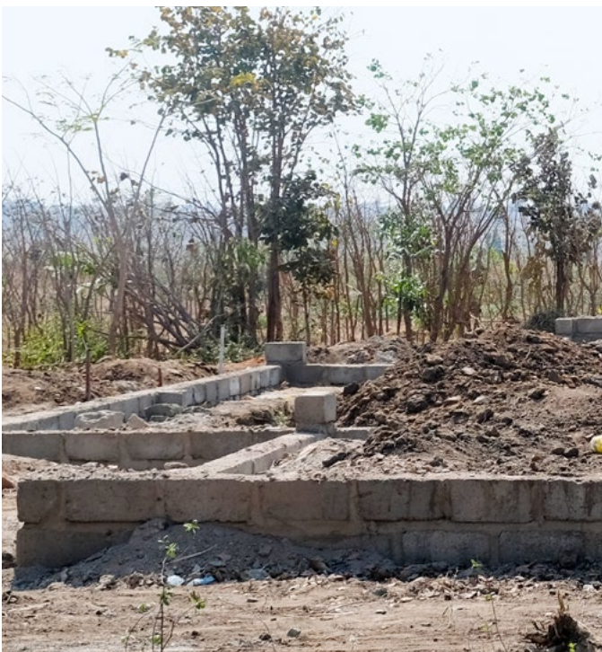
2nd duplex staffhouse still at foundation stage, Kuwala_2022.