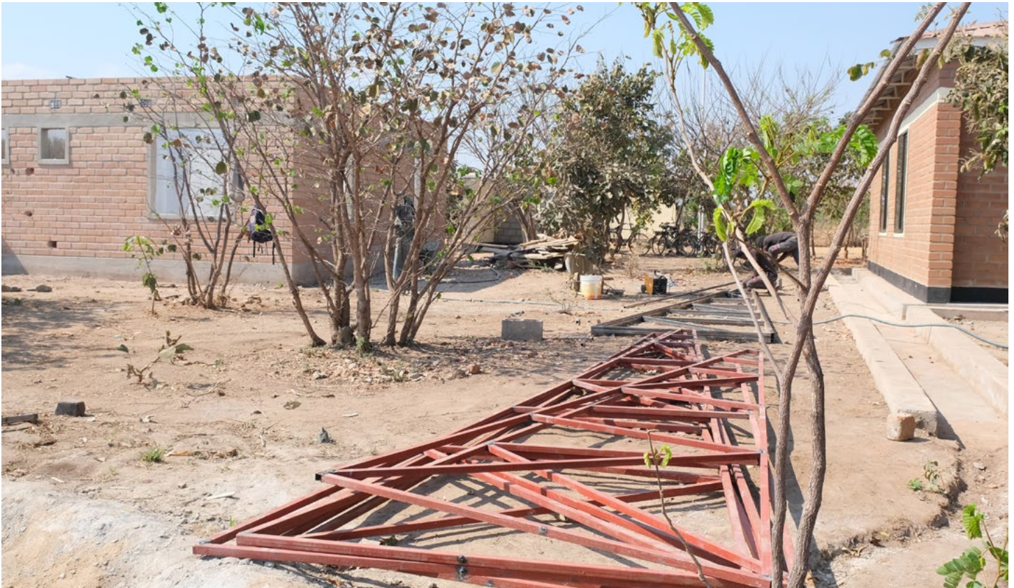
■ Metal trusses for 1st duplex staffhouse, Kuwala_2022.