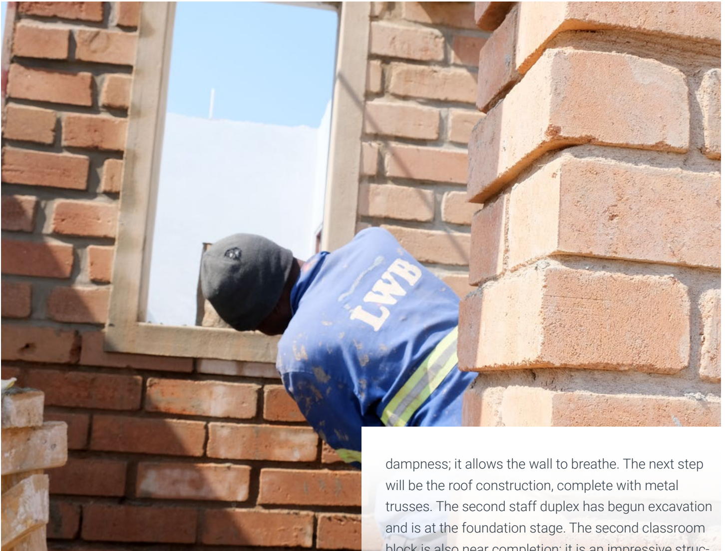
■ Worker reviewing window installation on the first staff duplex house, Kuwala_2022.