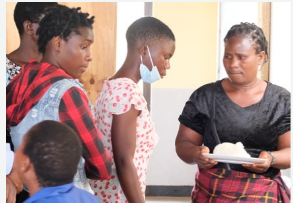
■ New parents and girls receiving food after orientation. Kuwala_2022.