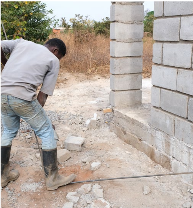
■ Worker bending metal for the maize mill ring beam, Kuwala_2022.

The maize mill is an important addition to the campus and also to the surrounding community.