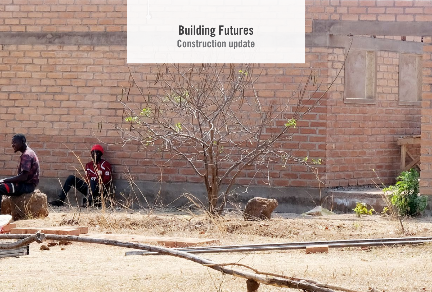
Workers taking a break in the heat of the day, 2nd classroom block exterior wall, Kuwala_2022.