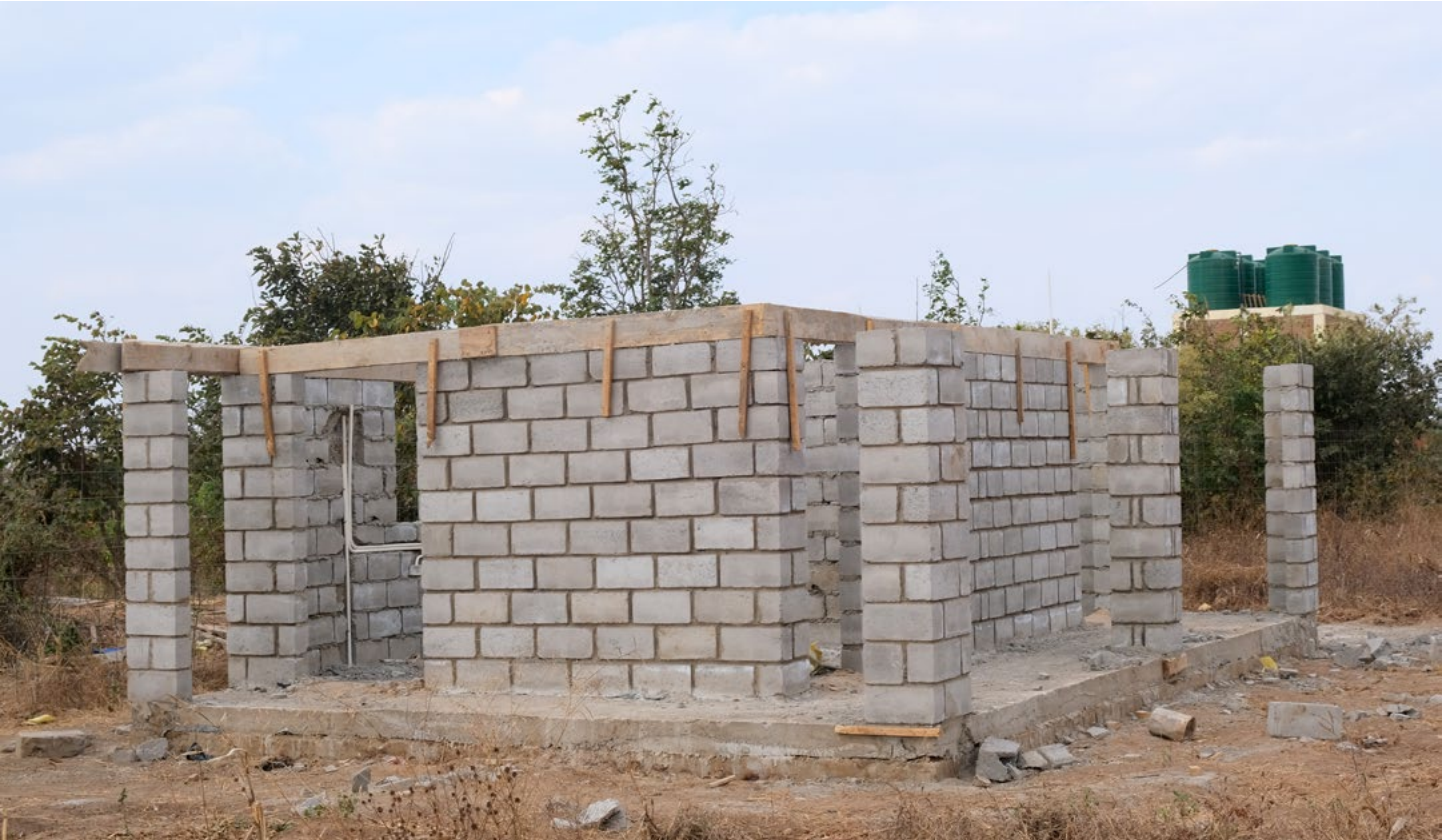
■ Maize mill at the beam level, Kuwala_2022.