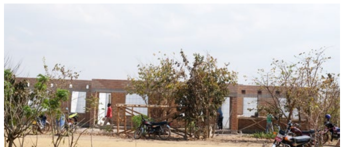
■ 1st duplex staffhouse exterior wall, Kuwala_2022.