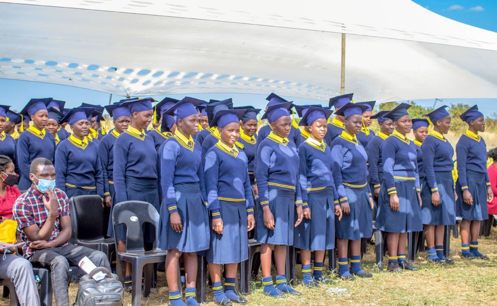
■ Graduating class of 2022! Kuwala_2022.