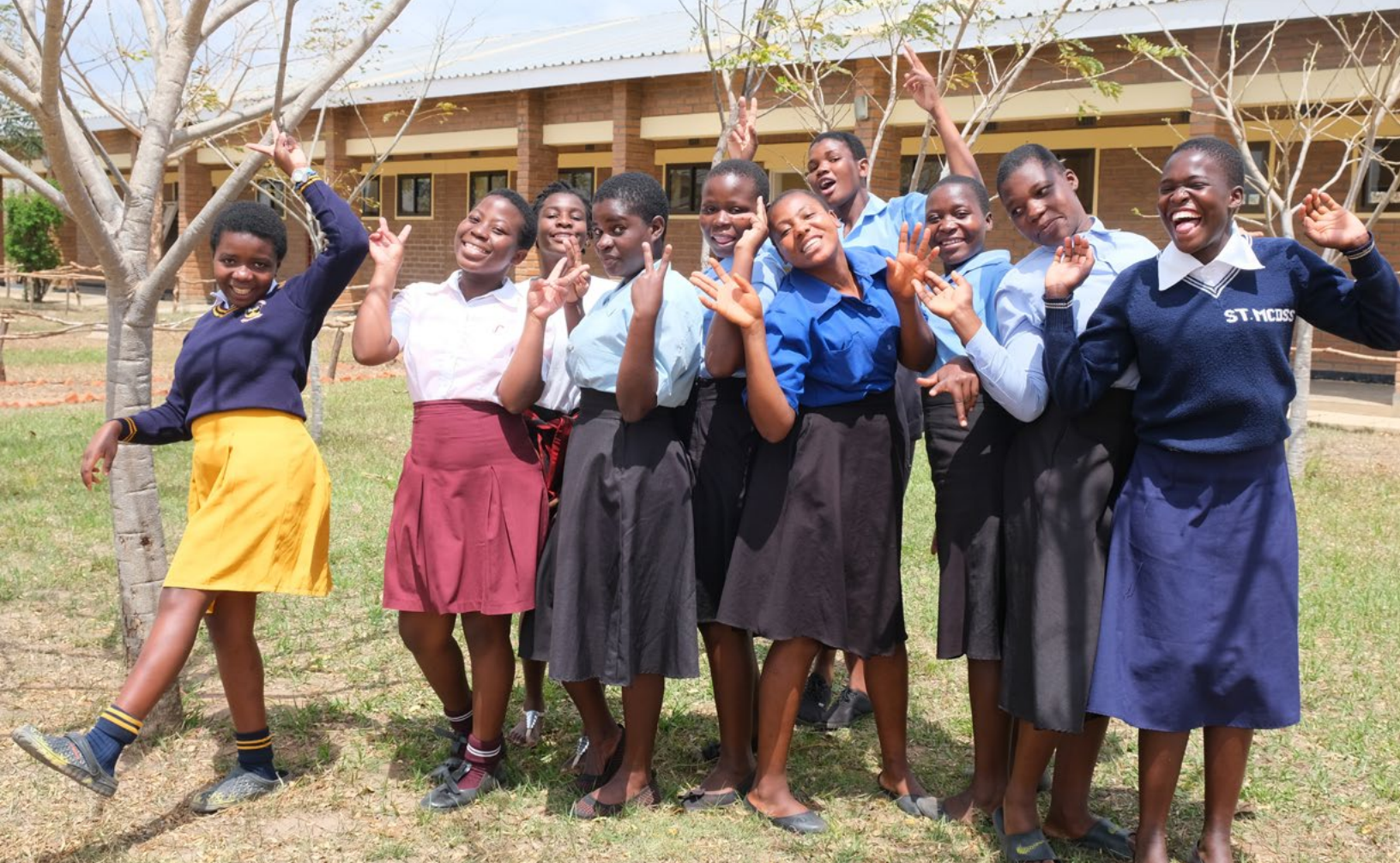
■ Students are happy to have successfully completed the bridging program and are ready to learn. Kuwala_2022.