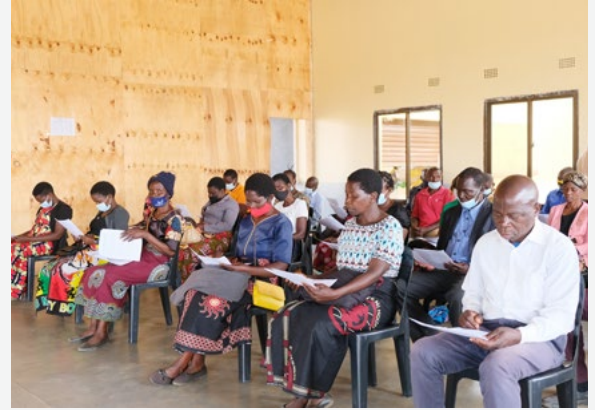
■ New parents reading school rules and regulations. Kuwala_2022.

The community involvement will bring strong support and encouragement to everyone at Kuwala.