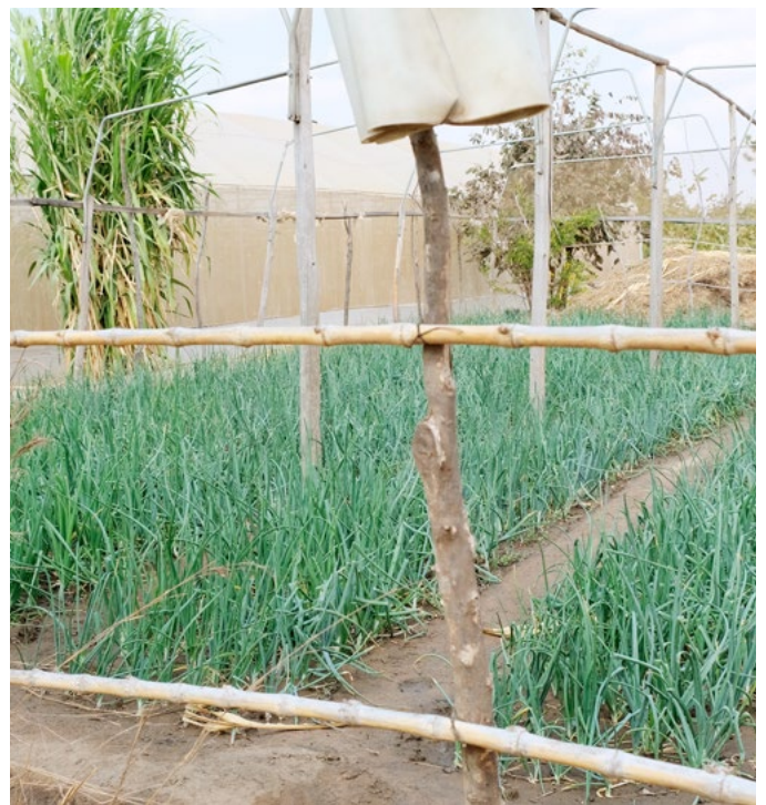
1st greenhouse growing onions, Kuwala_2022.