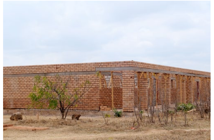
■ Second classblock above beam level. Kuwala_2022.