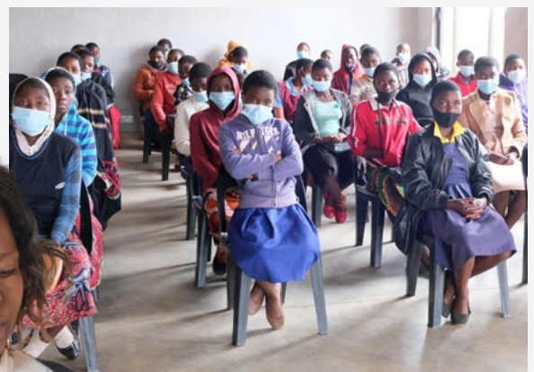
■ New cohort of Kuwala students. Kuwala_2022.

Schools in Malawi take a short break in September. October 2022 marks the beginning of the new school year. The 2022-23 school year will see the return of 120 girls, spread out in four classes Forms 1-4. It is equivalent to our grades 9-12 in North America.