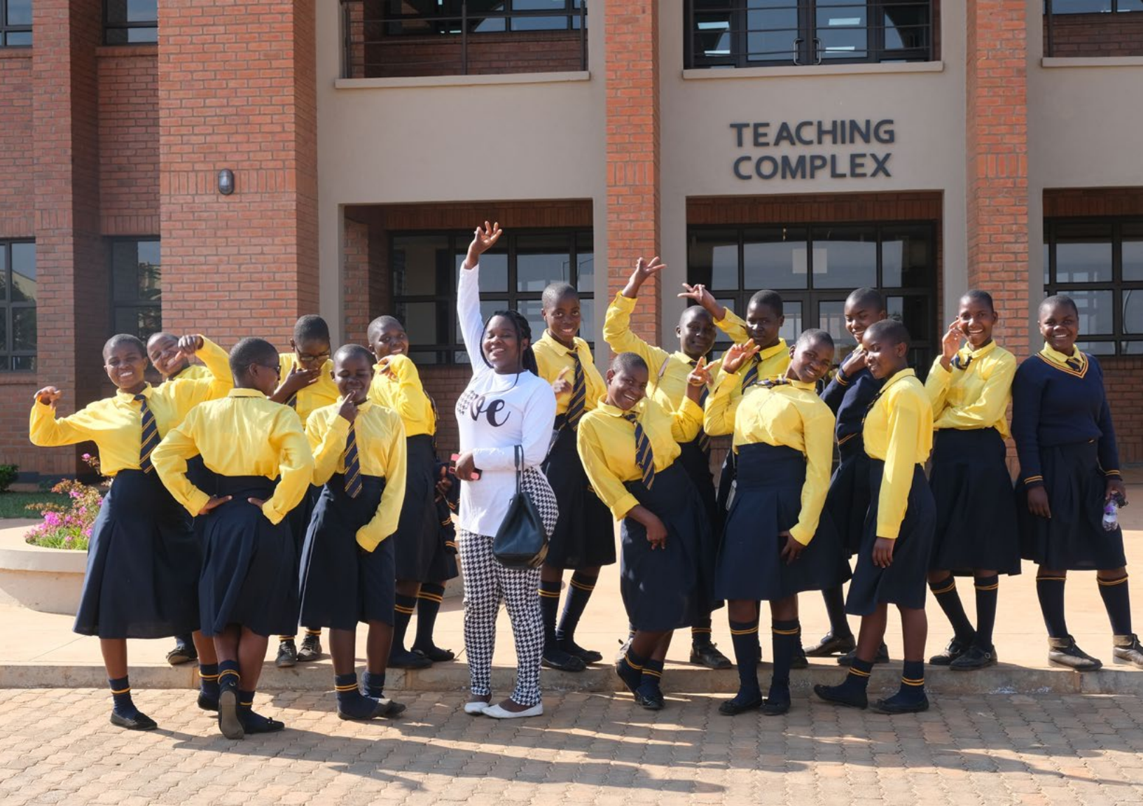
■ Photo Op. in front of LUANAR. Kuwala_2022.

At this College, Kuwala students toured an aquatic farming facility, livestock feed manufacturing industry, and experimental farming plots.