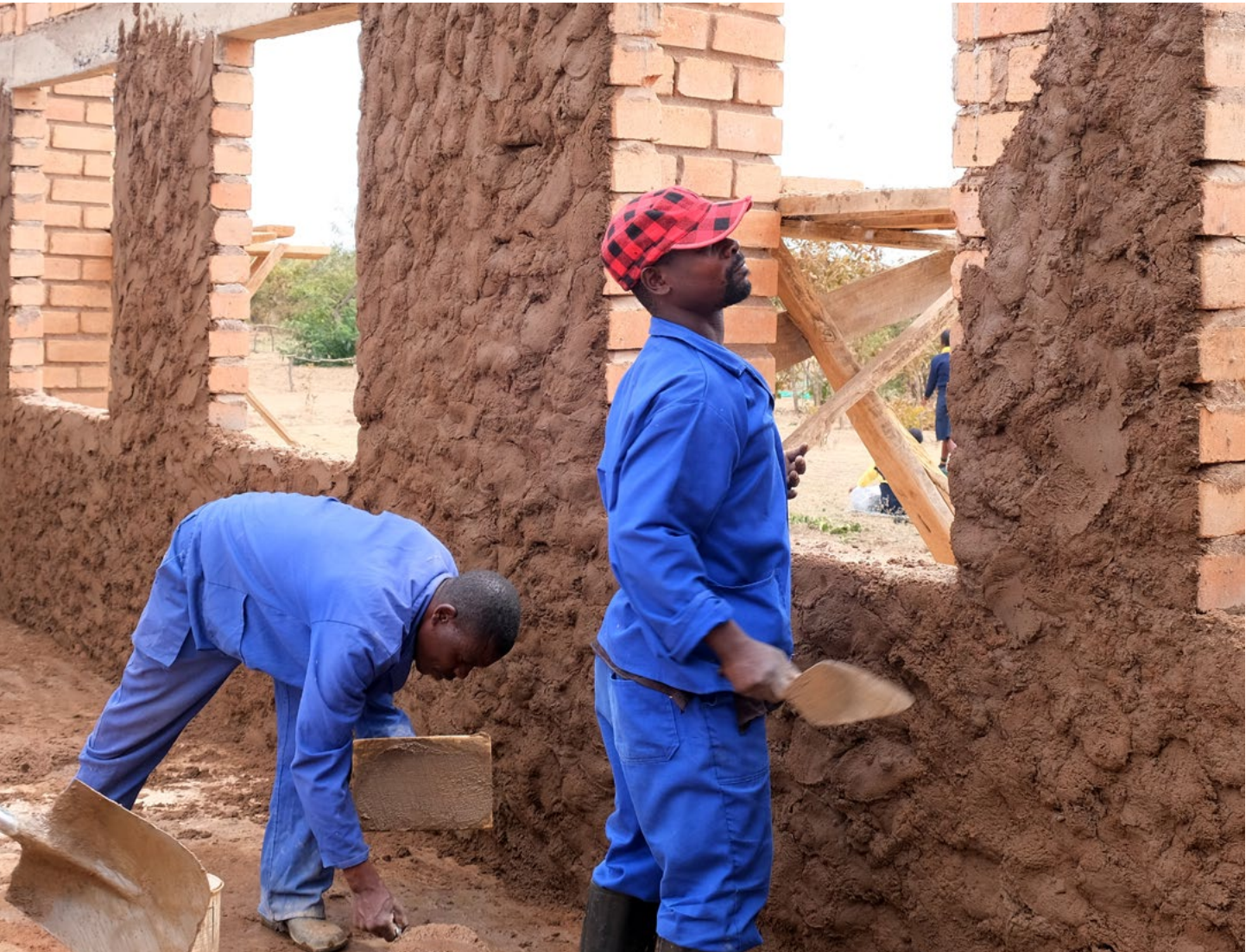
■ Second classroom block, construction worker using trowel to plaster the interior walls. Kuwala_2022.