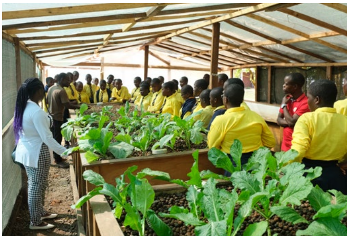
■ Girls in the grow room with vegetables using water from hatchery to add nutrients to the growing medium. Kuwala_2022.