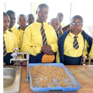
■ Demonstration of production facility where they make feed for fish. Kuwala_2022.

As the global population increases, demand is also increasing for food production methods that involve efficient use of resources and do not require large expanses of arable land. Aquaponics is a method that incorporates growing crops under soilless conditions (hydroponics) in addition to raising fish within the same system (aquaculture). Aquaponic systems are designed such that both the fish and plants utilize the nitrogen entering the system from fish food. The water circulation within the systems contributes to its more efficient use than traditional crop farming. The need for other resources, such as soil or chemical fertilizers, is also eliminated.