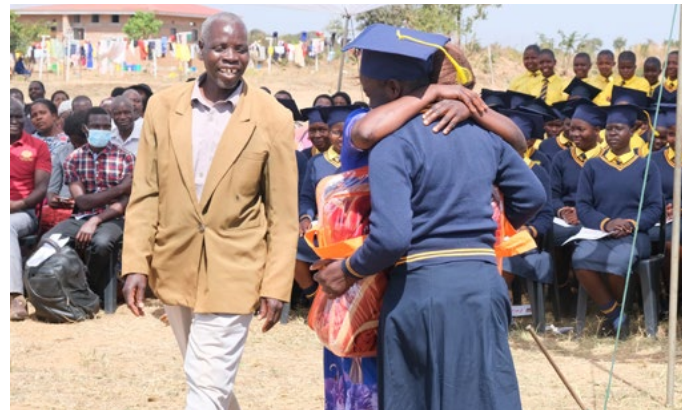
■ Parent hugging their daughter, Kuwala_2022.

Each of the girls was allowed to invite two from their families. Many parents, guardians, board members of Kuwala Christian Girls School and community members from around Kuwala attended. Families shared many hugs, cheers and even a few tears for their daughter's achievements. The girls have worked very hard and matured over the last four years. The students enacted a "career talk" drama on how they will move forward after Kuwala. In addition, there were singing and drama presentations, showcasing the many areas of learning. Every student received a certificate of attendance, with a few girls selected to receive recognition awards for