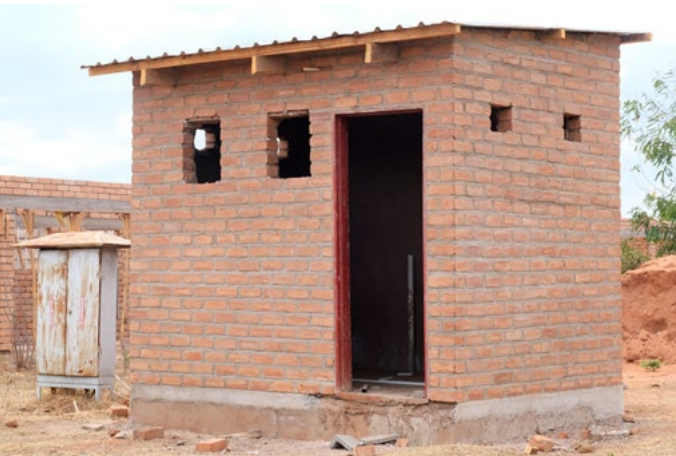
■ Construction of the new power house. Kuwala_2022.