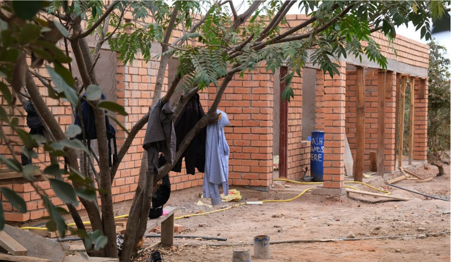
■ Front view 1 st duplex staffhouse. Kuwala_2022.