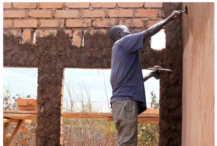
■ Worker plastering 1 st duplex staffhouses. Kuwala_2022.

Construction is moving along at a steady pace. The new classroom block and the first staff duplex are in the plastering stage, and wiring is being installed in the first duplex. The new power distribution house is almost complete. The foundation has begun on the maize millhouse, situated on the farmland beside the Kuwala campus.