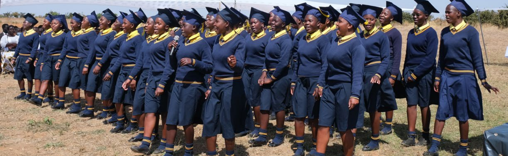
■ Graduating students performing. Kuwala_2022.