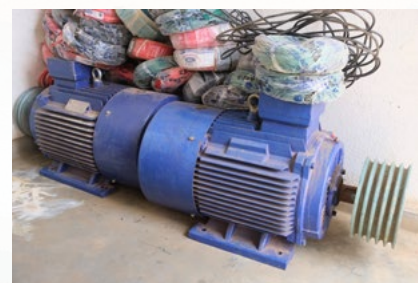
■ Electric motor assembly to run the maize grinder. Kuwala_2022.

After the corn is cleaned, the grinder is used to process the corn into maize flour. In Malawi, access to a maize grinder is difficult, costly, and time consuming without reliable power and long distances to travel to process. Currently village women walk 5km one way with grain carried to be ground and then return. With regular power outages they often show up and the power is down so they need to repeat . Having our maize program is a big win for them.