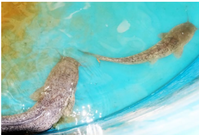
■ Catfish in the hatchery. Kuwala_2022.