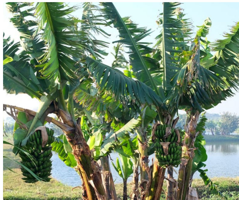
■ Bananas growing near fish ponds. Kuwala is investigating growing bananas as a crop at the campus on the new farm. Kuwala_2022

The school management organized this exposure trip to enlighten the girls on other avenues they might have missed as they leave Kuwala. It also motivates the girls to work harder as they prepare for their national examinations. Yes, they graduate first but write their exams to receive a final mark.