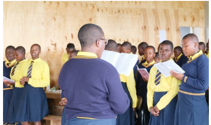
■ Students singing hymns at St. Peter's Assembly Hall. Kuwala_2022.

3:00 pm. The student observes time for sports and physical activity. For example, students change into their sports attire to participate in physical activities such as football.