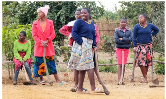
■ Girls organizing themselves for a field visit; weeding, and caring for growing young trees on a previous visit. Kuwala_2022.

Watch for the email coming soon with the link that will provide highlights of the 2021 AGM presentation and video messages from our team in Malawi. Right now... you can go to the website at Kuwala.org to view the 2021 Annual Report. You can find it by clicking on the plus [+] icon on the operations tab at the top of the home page.