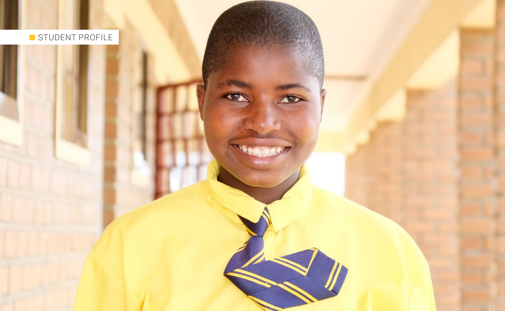
Takondwa image taken outside classroom block one. Kuwala_2021.