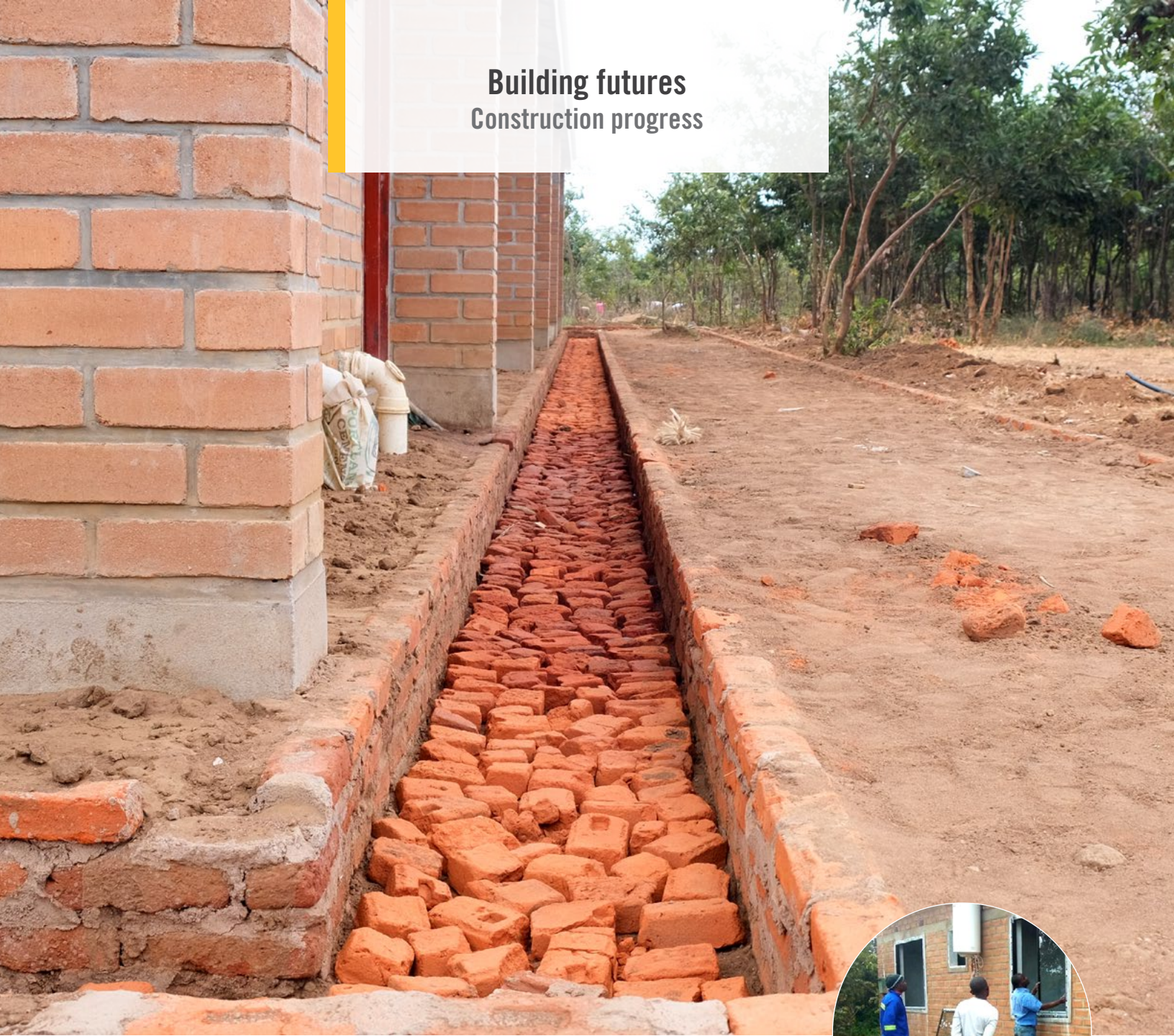
■ LH_Drainage around foundation of second hostel. Kuwala_2022.