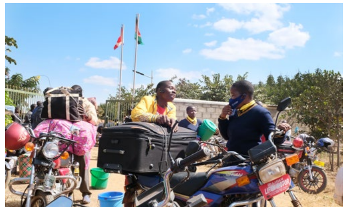
■ Different mode of transport take girls back home. Kuwala_2022.

The students were excited to take a break and go home for two weeks to visit their families. They had the opportunity to review their progress reports with their teachers and then take them home to check with their parents. The parents come from near and far on many different modes of transportation to meet their daughters and teachers. It is the final break before National Exams for Form 2 and Form 4. The Headmaster at Kuwala says the girls are very prepared by writing many mock exams, to understand what will be expected when they write the finals.