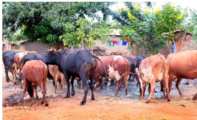
Takondwa enjoys agriculture, including animal production. Kuwala_2022.

I enjoy living on campus because of the delicious food my parents could not afford, safe drinking water from a tap and safe bathing water from the shower.