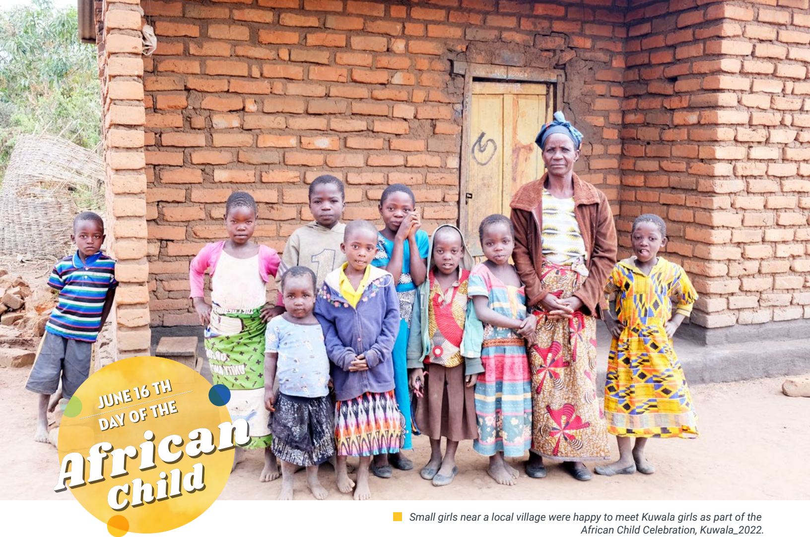
■ Small girls near a local village were happy to meet Kuwala girls as part of the African Child Celebration, Kuwala_2022.