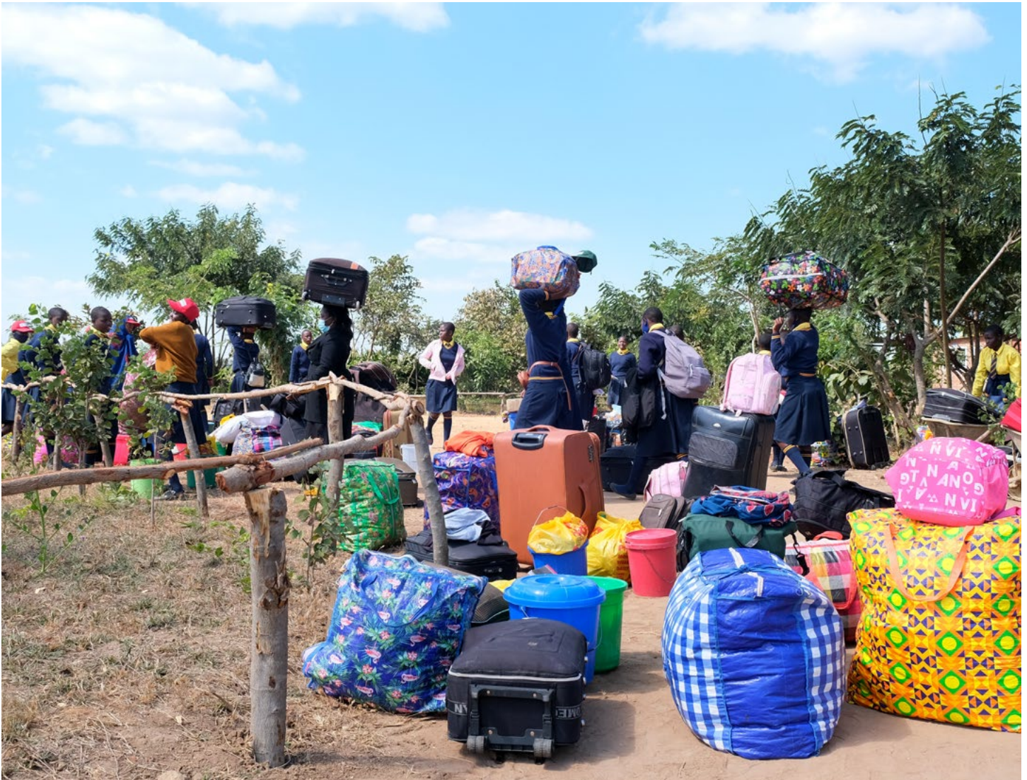
■ Students' luggage ready for the ride home to their villages. Each girl comes from a separate village in Malawi. Kuwala_2022.