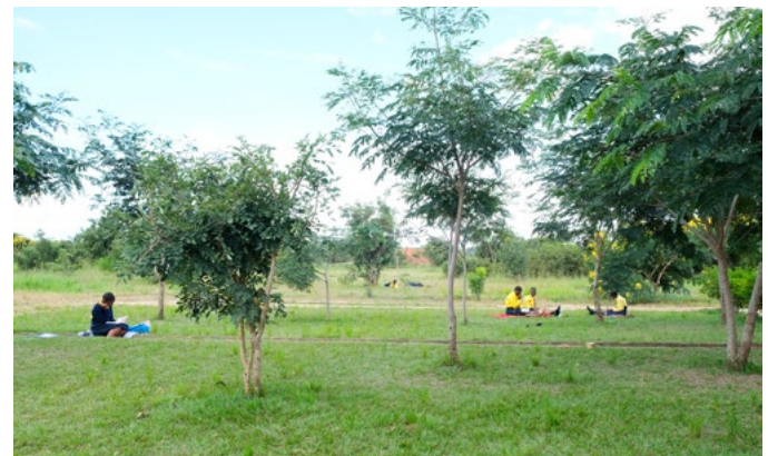
■ Planting trees is also part of the plan for resiliency. Kuwala_2022.

Malawi, like many developing countries in Africa, is grappling with adverse impacts of climate related events. With a population that is dependent upon substance agriculture, climate change also impacts food security. The campus is growing as much food as it can to help improve food security for the students.