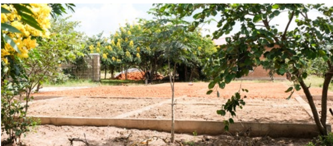
■ This is our first staff duplex to compliment the two individual staff houses, Kuwala_2022.