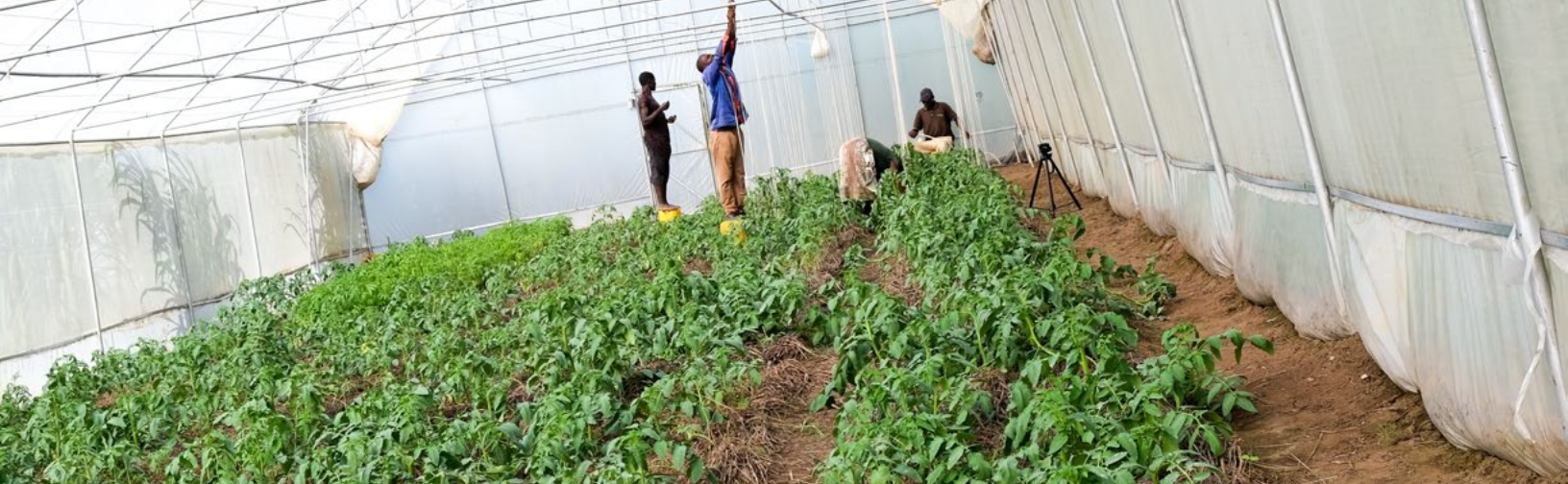
■ Growing tomatoes, using sustainable farming practices and drip irrigation to deliver just the right amount of moisture. Kuwala_2022.