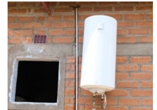
■ Top LH floor and foundation has started on the second classroom block, Workers are laying reinforcing steel for the poured concrete floor: Top RH: Old kitchen used to store onions: we have funding secured for a trades workshop and are about to start renovations.. RH middle: workers installing drainage system for St. Peter's Assembly Hall. RH bottom: electric hot water installation on second staff house. Kuwala_2022.