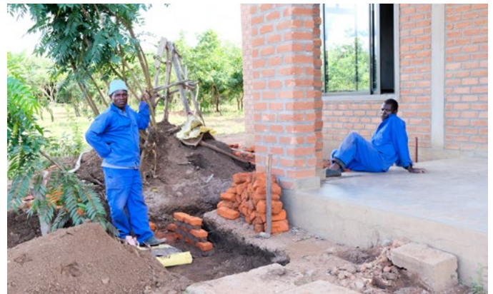
■ Water drainage around the St. Peter's Assembly Hall foundation helps with drainage in the rainy season which in 2022 resulted in extensive flooding in Malawi. This is one of the ways we prepare for extreme weather events. Kuwala_2022.

The key goals of the committee are to act responsively and proactively; understanding the issues, assessing potential risks, and identifying reasonable actions to mitigate impacts. Each month a focus topic will be explored in depth, and ideas will be shared in our newsletter. So keep reading and learn about how Kuwala is building resiliency in a changing climate.