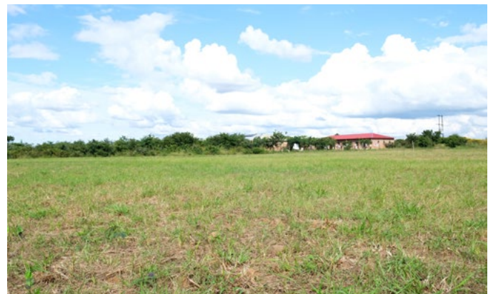
■ Soccer pitch now has grass and almost ready for play, Kuwala_2022.

The grass on the soccer pitch is lush and green. The grounds crew has already mowed the first cut and groomed the area. When the sports equipment arrives, the girls will be playing soccer, netball and Frisbee. They are so proud to be wearing their school sports uniforms as they participate in field games with their classmates, hosting or visiting schools from other communities.