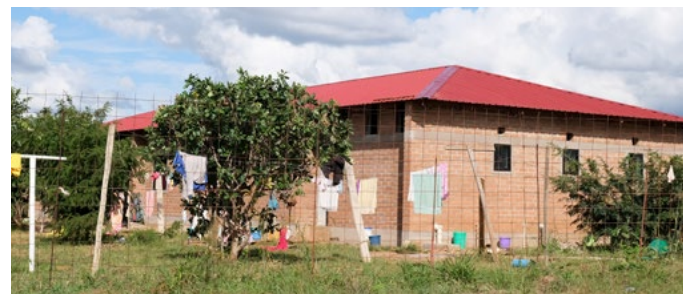
■ Second hostel completed with the next 60 students are moved in, Kuwala_2022.