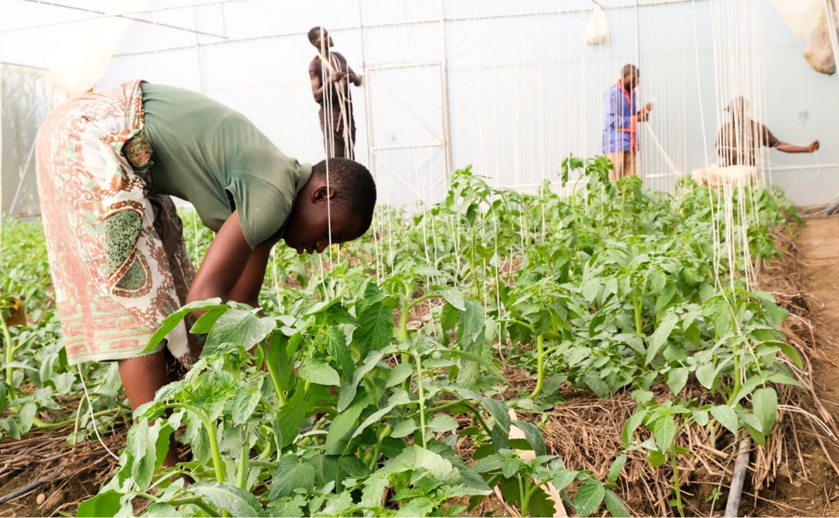
■ Students are learning about agriculture to help the Campus grow food but also to help the community, Kuwala_2022.