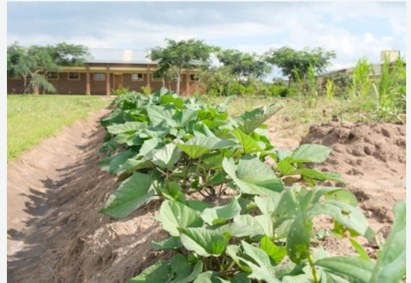
■ Sweet potatoes planted on the terrace helps draining runoff water from classblock. Kuwala_2022.

Kuwala will soon order soccer field equipment as the lawns continue to grow lush during the rainy season. In the meantime, a temporary volleyball court provides a schedule of activities to keep the girls active.