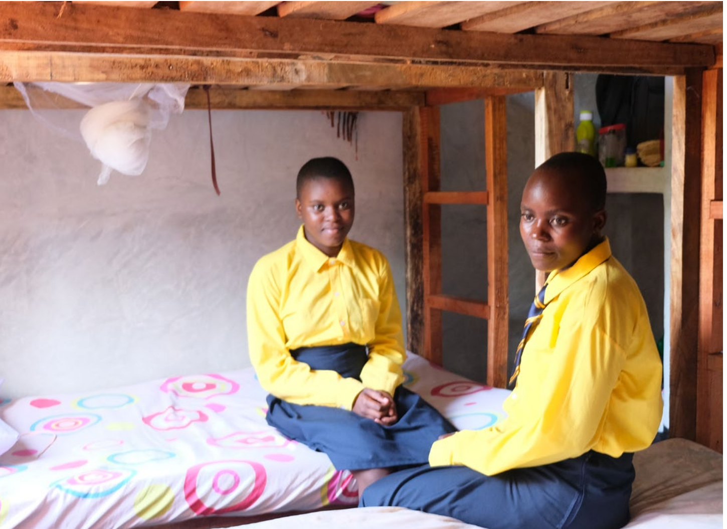
■ New hand-crafted, locally made—bunk beds shown with hanging mosquito netting, Kuwala_2022.