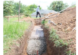
■ Top RH: Foundation, footing installation-second classroom block, Kuwala_2022.