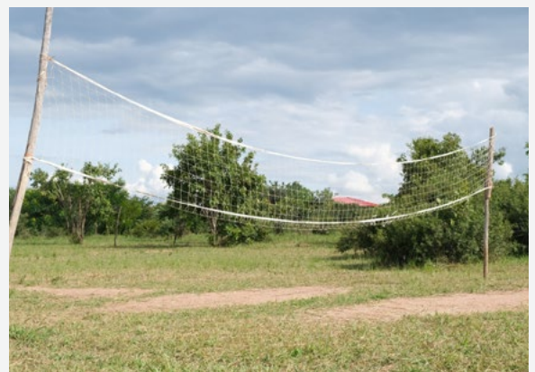
■ Area temporarily been used as volleyball ground. Kuwala_2022.