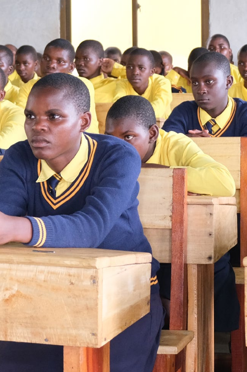
■ New desks in action in the temporary classroom, St. Peter's Assembly Hall. Kuwala_2022.