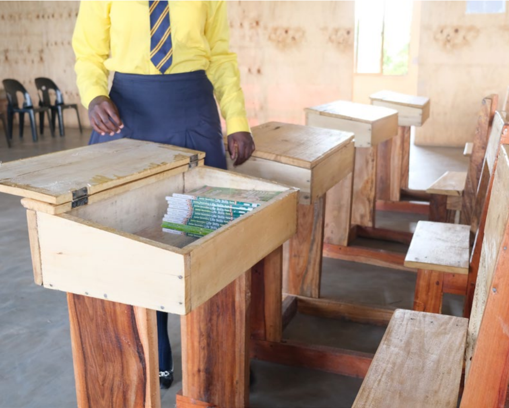
■ Top LH: New desks that open to keep books, Kuwala_2022.