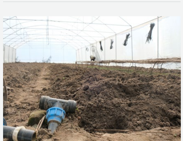
■ Tilled soil in the greenhouse being prepared to transplant tomatoes. Kuwala_2022.