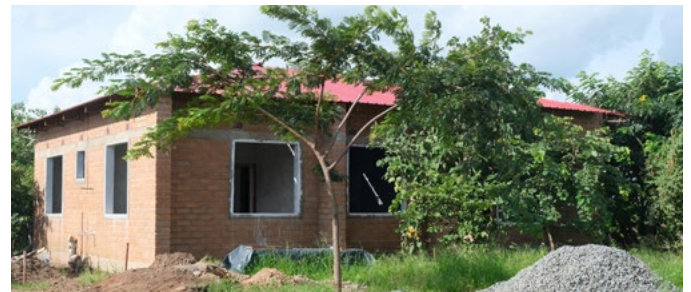
■ Second staff house, Above RH: interior scratch coat, Above: Middle image, staff house steel roof and trusses, Kuwala_2022.