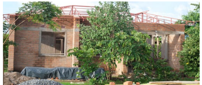
■ Second staff house steel truss installation, Kuwala_2022.