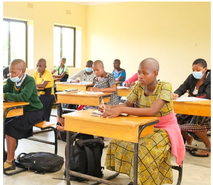
■ New Form 2 students. Kuwala_2022.