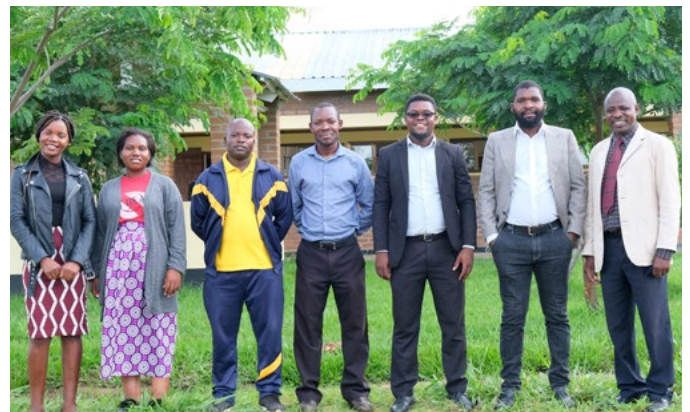
■ Teaching team of 2022, Kuwala_2022.

The new group of girls moved into the second hostel, and although the bunk beds had not arrived; comfortable mattresses and warm blankets did! Many of the girls are excited to be experiencing running water and flushing toilets for the first time. While their uniforms and desks have not yet arrived, the teachers began classes and are excited to be off to a great start. Settling in is always exciting, and we have to keep in mind that these girls come from humble beginnings with room to grow, learn, expand, and adjust. Albeit, these are essential life skills that develop patience and appreciation; these new students are grateful for this opportunity.