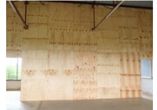
■ Temporary classrooms.