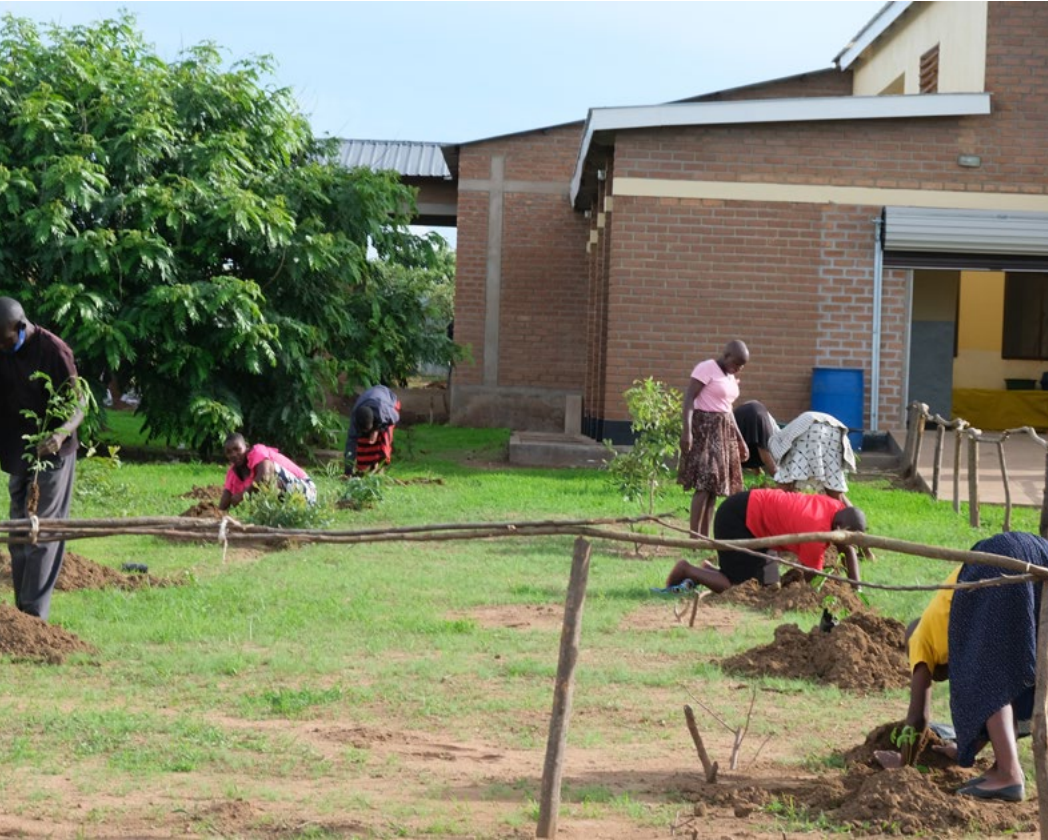
■ Fencing around St. Peter's Assembly Hall to encourage rapid growth of the landscaping. Kuwala 2022.