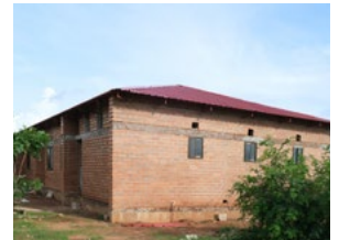
■ 2 nd hostel functional.