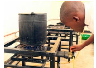
■ Firing up the burners.