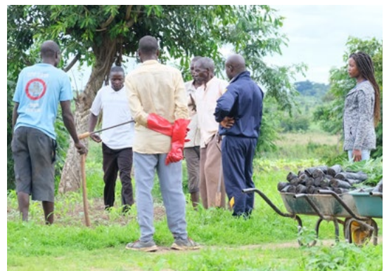
■ Village leader showing the actual place to start planting trees Kuwala_2022.

It's the rainy season in Malawi, and the campus is turning lush and green. It is the perfect time for outdoor tree planting. Every girl will participate in this work to appreciate the trees and the environment. As part of the school's Community Outreach, the students will be traveling to 3 surrounding villages to plant a small plot of trees in each village. The green landscape and the canopy of shade that the trees bring to the campus are remarkable. Kuwala will be sharing these tree plantings in surrounding villages and educating on the importance of nurturing and caring for the trees.