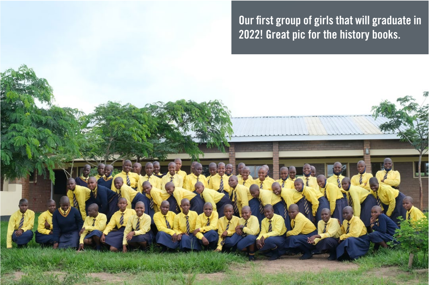
■ Our veteran Form 4 students taken outside of Classroom Block N°1. Kuwala_2022

Our first group of girls that will graduate in 2022! Great pic for the history books.