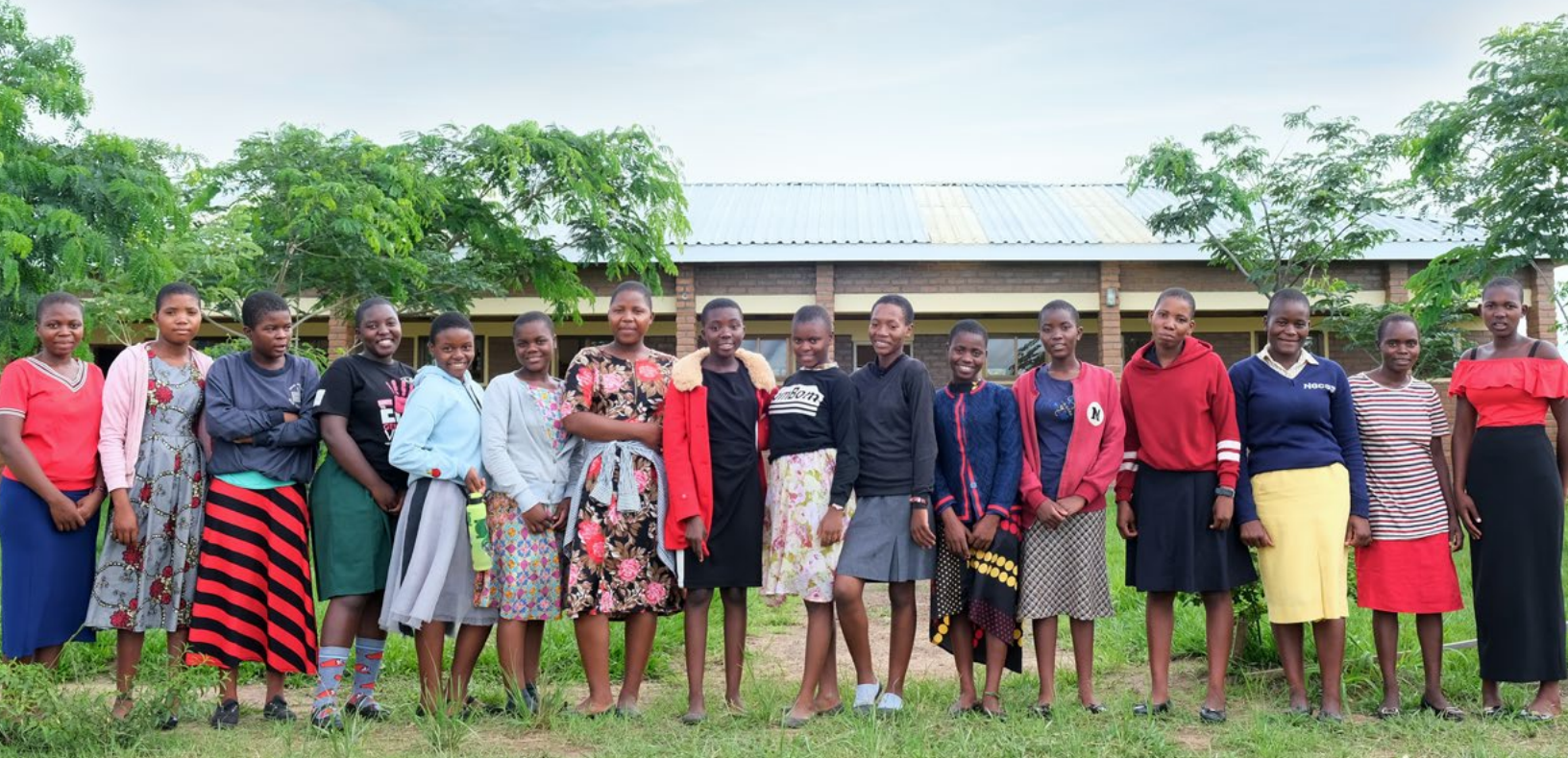
■ Kuwala Form 3 class of 2022, Kuwala.