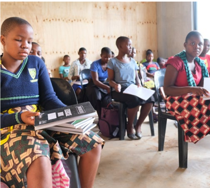
■ New Form 1 students in a temporary classroom. Kuwala_2022.