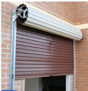
■ Roll-up door to kitchen.