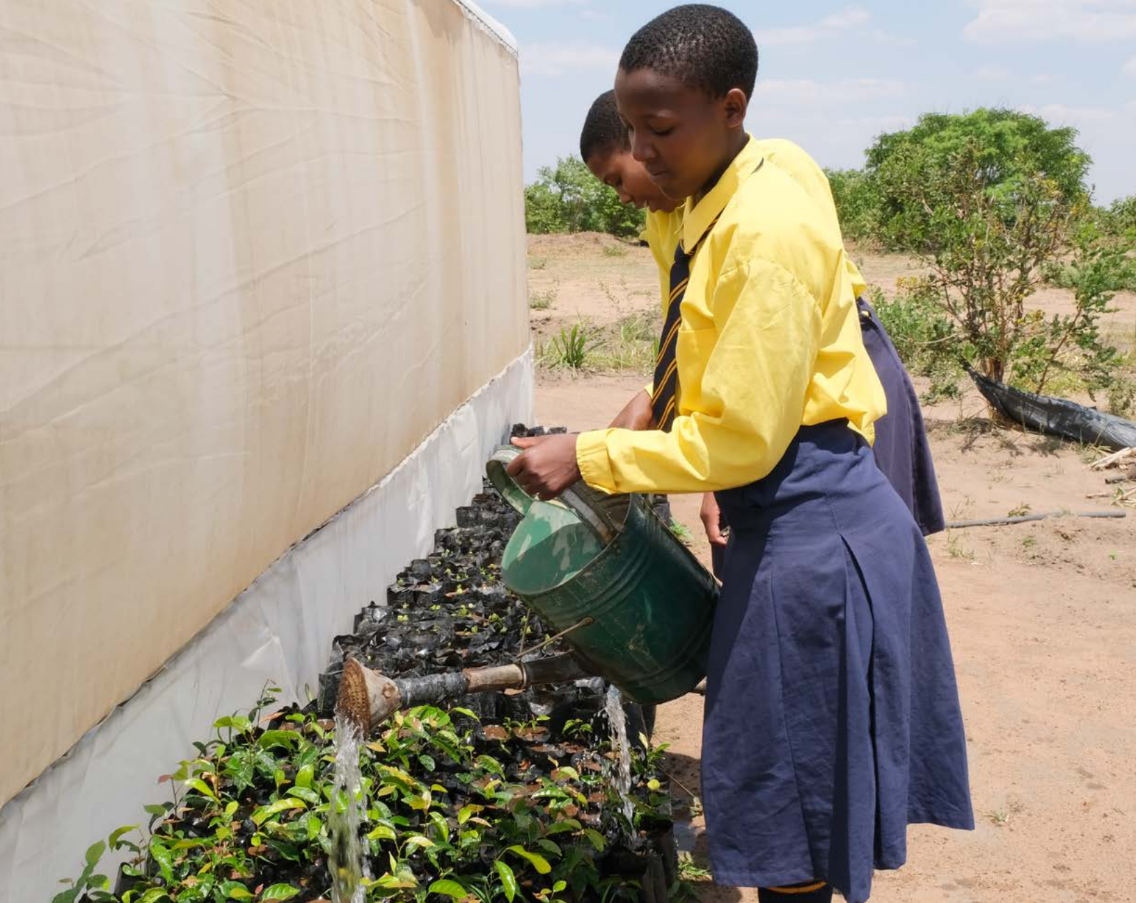
Kuwala students watering outdoor garden next to the greenhouse on campus. Kuwala_2021

The greenhouse plants are thriving, and the Campus is adding to the fruit trees in the Orchards. The outdoor gardens are ready for the upcoming rainy season. A variety of new vegetables will be sowed, including plants from the mustard family.