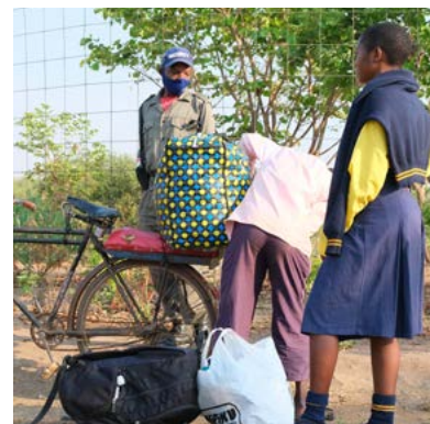
Transportation home included: walking, bicycle or motorcycle. Kuwala_2021

In 2022, Kuwala are planning for 120 registered students at the Campus comprising four-forms. If you have been following the growth and development of our first 60 girls over the last few years; these girls will graduate next September. So the future at Kuwala looks bright. Kuwala expects to graduate a class of form-4 each year while welcoming a new form-1 to the Campus.