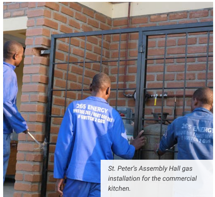
St. Peter's Assembly Hall gas installation for the commercial kitchen.