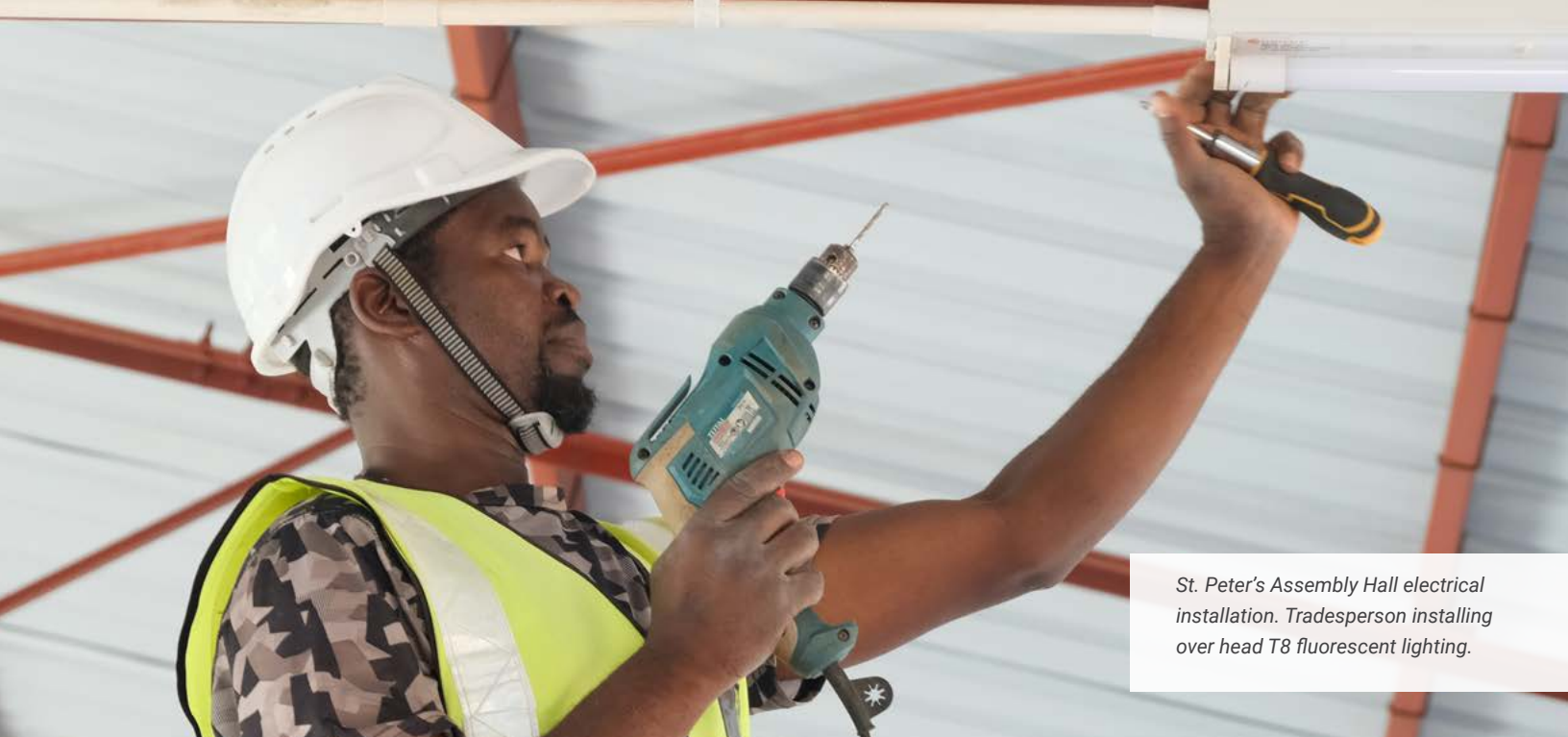
St. Peter's Assembly Hall electrical installation. Tradesperson installing over head T8 fluorescent lighting.