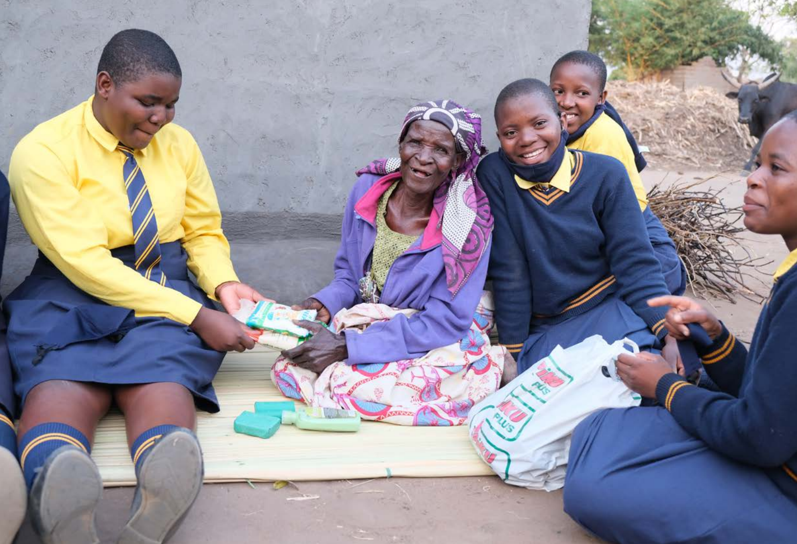
Village outreach program by Kuwala Students_2021