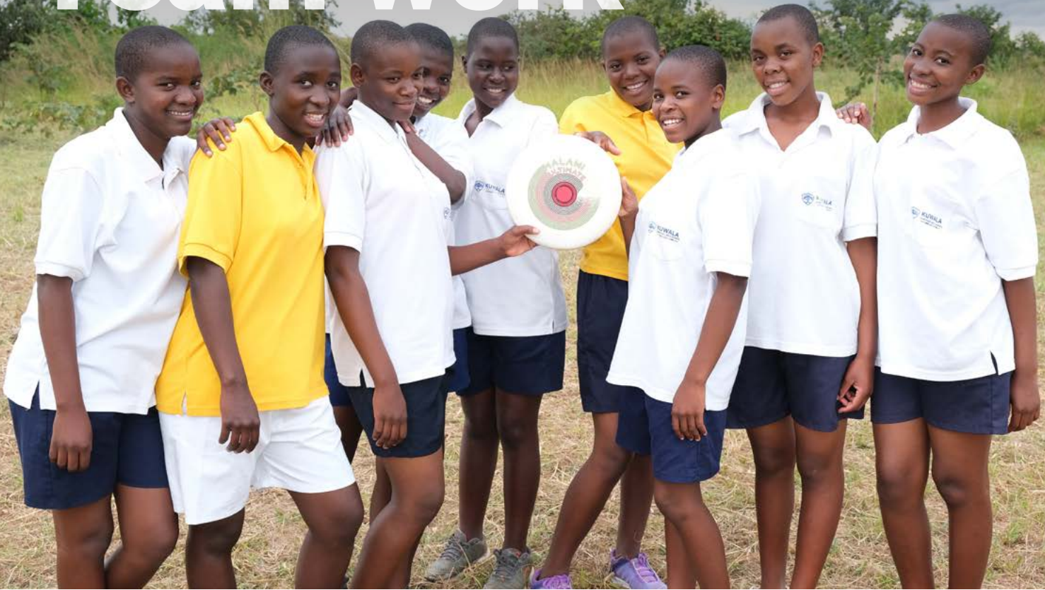
Girls working on their Frisbee game. Kuwala_2021

Bottom row shows students demonstrating concepts in biology. While academic studies are important, the girls are extra committed to the surrounding village with Kuwala's Outreach program, where they help the elders fuel the spirit.