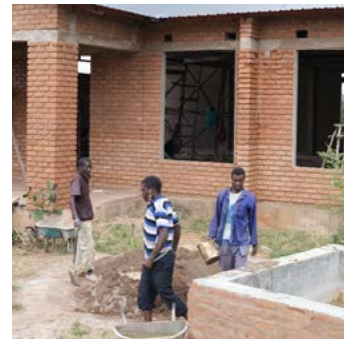
Super structure is complete

A secure and rugged metal roof is now on the St. Peter's Dining Assembly Hall, and the tradespeople are making great progress to finish one of the most impressive buildings on campus! Students will soon be eating and meeting in this majestic structure!