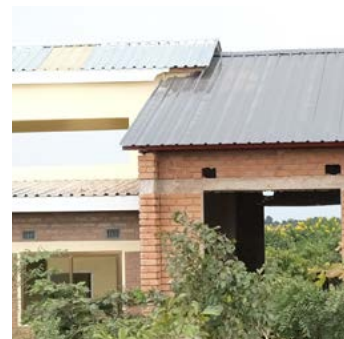
About half the windows are installed