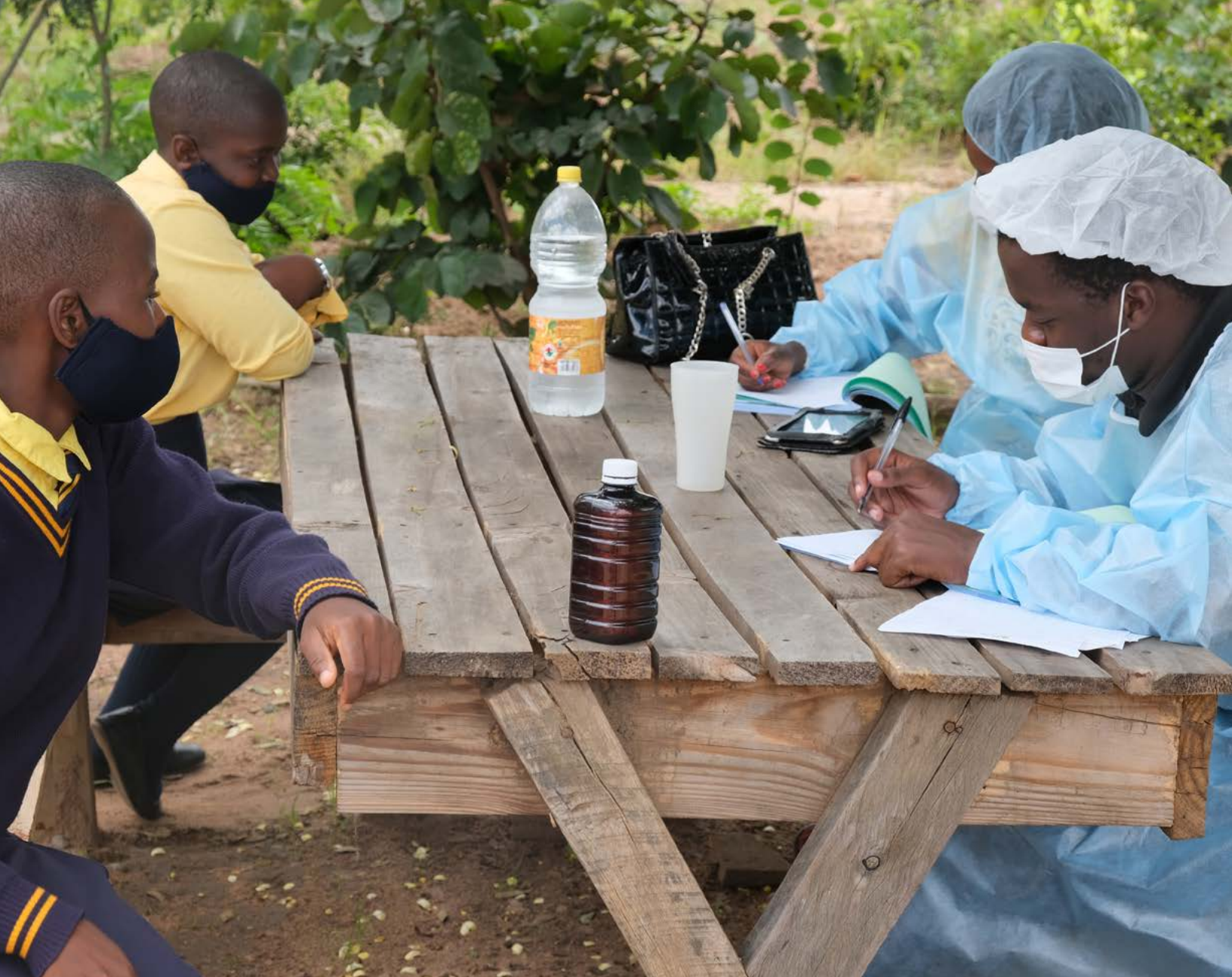
Government COVID19 Response team at Kuwala.

Kuwala has been registered in Malawi and is now officially a school recognized in Lilongwe Rural West's Division. It is an exciting achievement. It provides identification and our school's ability to become active within the school division and be selected to participate in many pilot projects for education. One of the opportunities from this registration was that Kuwala was a chosen school for Covid 19 screening. Good news; all of the girls on campus tested negative.