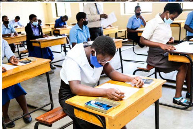
Kuwala is in the process of recruiting for new students. Image shows entrance exams being written at Kuwala.