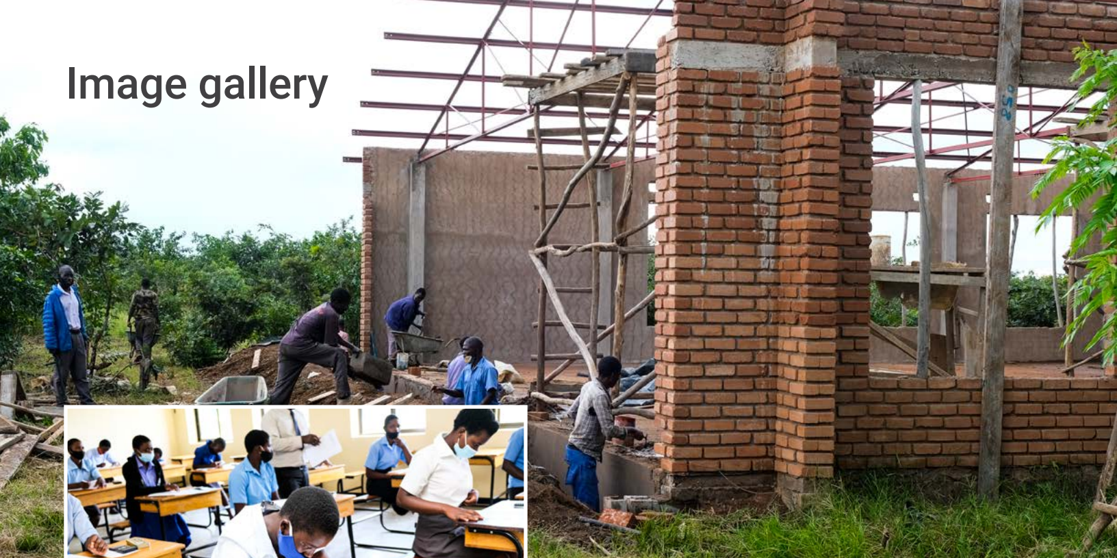
Work crew working at the footing level to finish off the last —end wall— on St. Peter's Dining Hall. Note: each brick is cured locally back on the 7 th of March. They will back fill the trench when the wall starts to fill in.