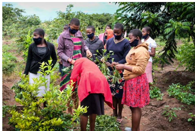
Students helping upgrade the orchard with sweet potatoes vines.

Kuwala's Computer Science lab. The class is an engaging hands-on class and constitutes an excellent opportunity for the students. It is rare to see computers being taught in any Malawi school, let alone at the high school level. Along with theory, the class is providing practical computer skills such as Microsoft Word®, Excel®, and PowerPoint®, where this has direct job opportunities. While Kuwala is not yet designated a school of excellence in Malawi, the fact is we are quickly moving toward this goal. This program could not happen without the Kuwala Canadian Board working with local companies in Winnipeg to deliver IBM® laptops that IT professionals have refurbished.