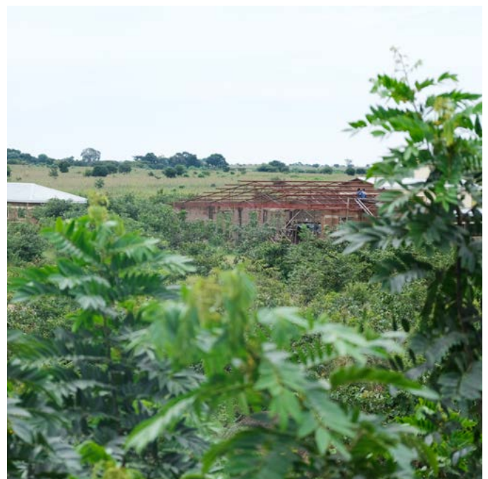
Image shows St. Peter's dining hall steel roof truss construction and the surrounding greenery.

Through this generous contribution and vision from a Lutheran church congregation in Manitoba, Kuwala can now qualify to become a host examination location for other Malawi schools. Our goal, to become a recognized school of excellence is becoming a reality.