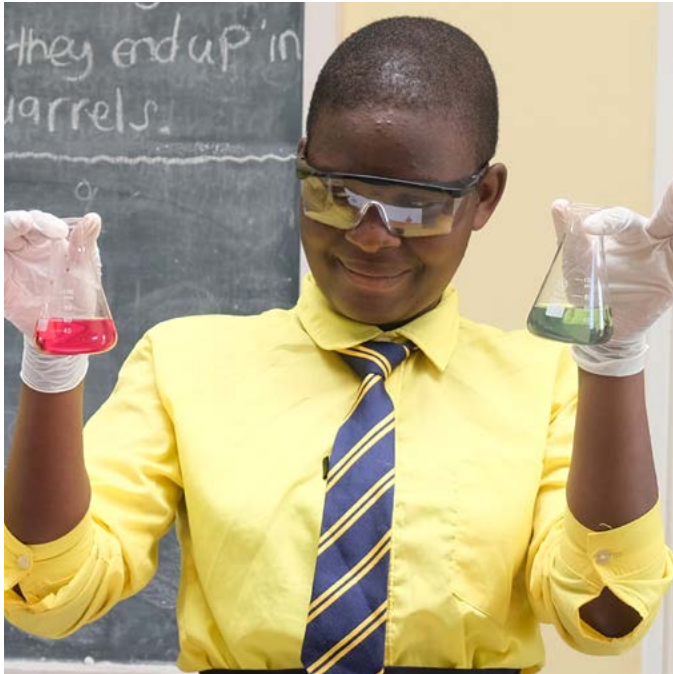
Chemistry demonstration just before Malawi went into COVID-19 lockdown. Kuwala_2021