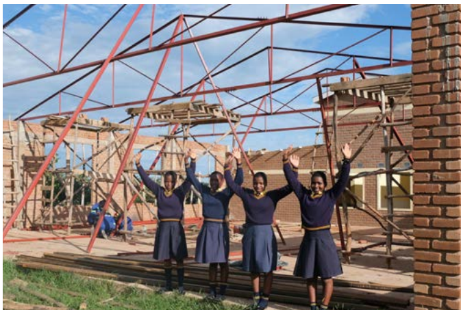
Raising the rafters on the dining hall, Kuwala_2021

As the pandemic sweeps across Africa , the Malawian Government closed all schools at the beginning of February. On February 22, all schools reopened, allowing our girls to return with renewed excitement and learning readiness. During the lockdown, the girls returned to their homes in rural areas. These rural areas are more isolated, but the girls monitored themselves while at home. The Government has also extended the school year to ensure the girls complete all the required academics for the Term.