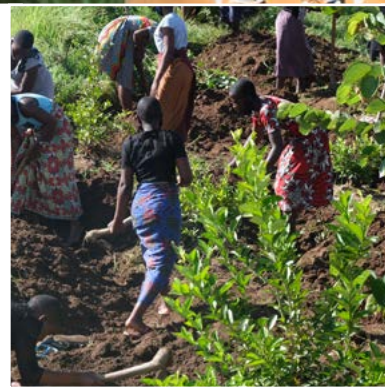
Kuwala girls working in the orchid field where they are planting lemons, guavas, mangos, and peaches.

The Kuwala girls help out where and when they can. The photo shows how hard the girls are willing to work for what they have. This is volunteer by the way! The girls actually enjoy the learning experience of construction. Image shows girls moving the cinder blocks to build the new hostel.