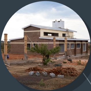
St. Peter's Assembly Hall