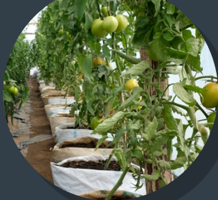
Greenhouse & Gardens