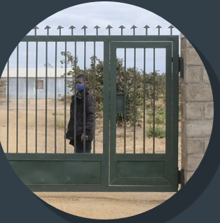
Gate entrance w/ full perimeter fencing